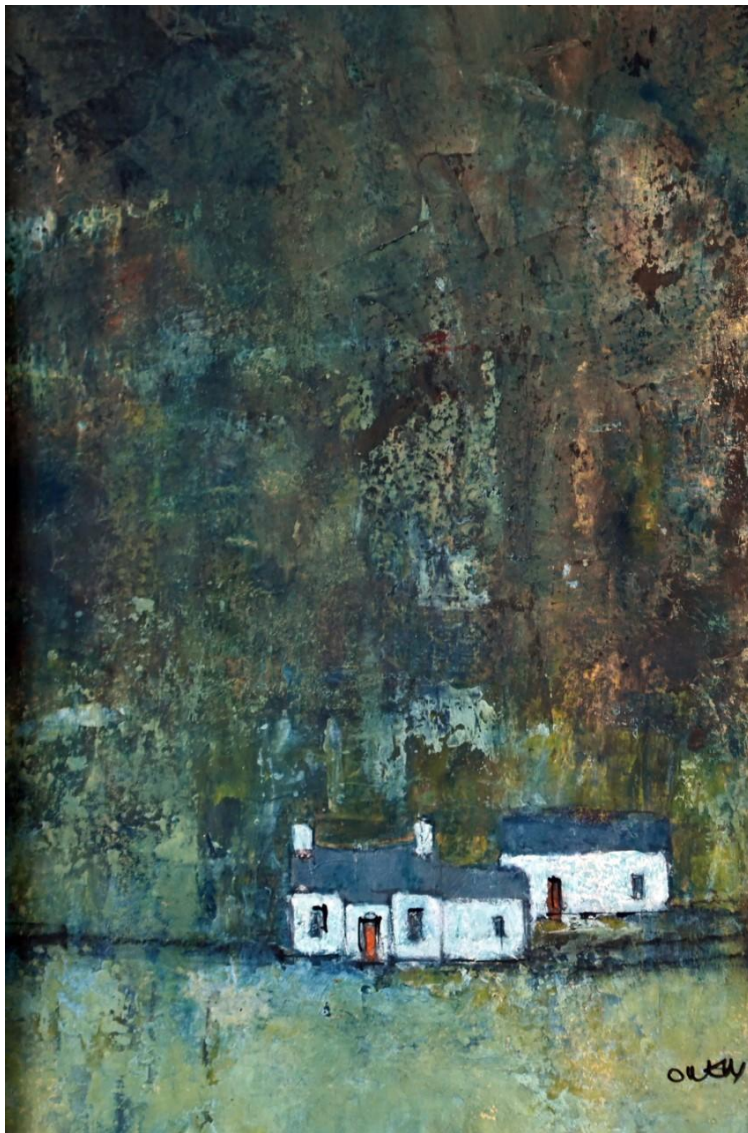
Preseli Cottage – acrylic on paper, 57 x 49cm framed - £495