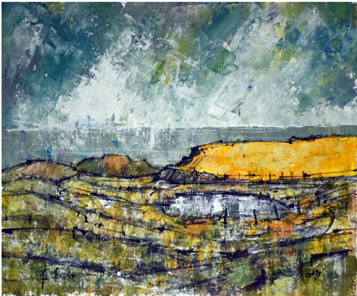
Pembrokeshire Coast – acrylics on paper, 62 x 54cm framed - £525