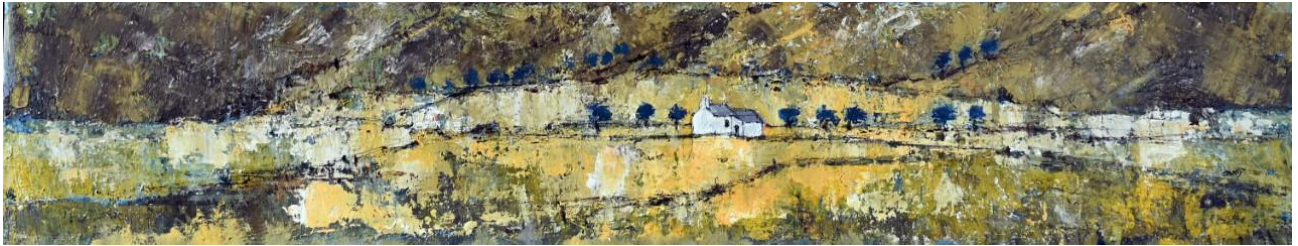
Lleyn Cottage – acrylics on canvas, 104 x 24cm framed - £695