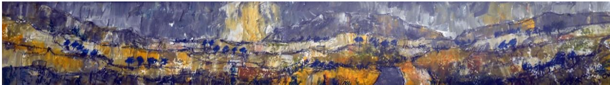
Cwm Ogwen – acrylics on paper, 120 x 42cm framed - £725