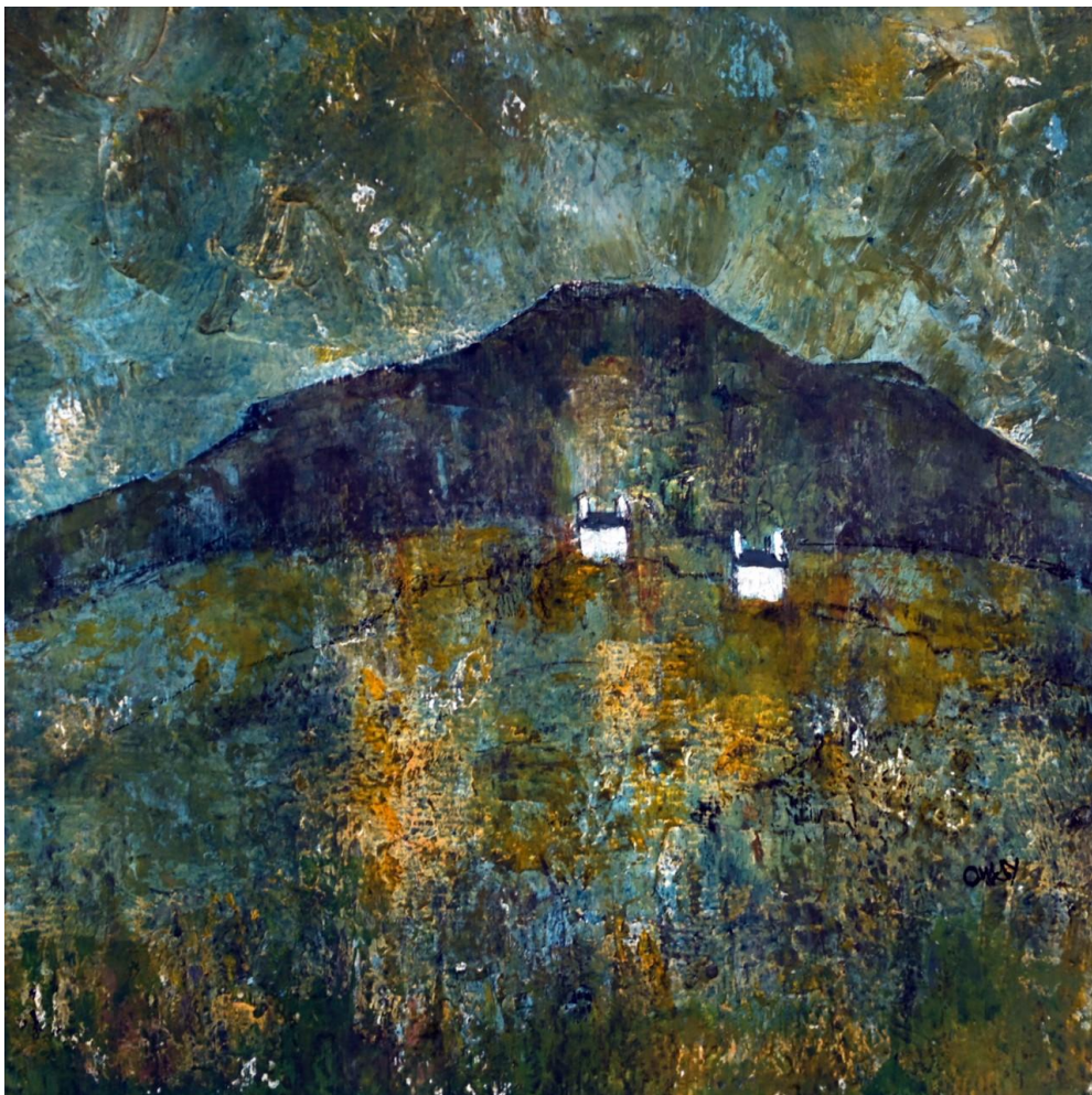
Pembrokeshire Landscape – acrylics on paper, 59 x 59cm framed - £550