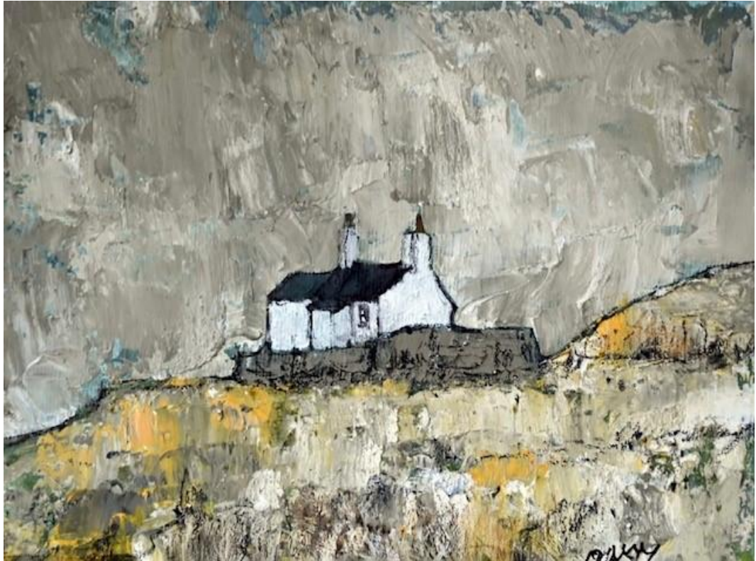
Pembrokeshire Cottage – acrylics on paper, 48 x 40cm framed - £450