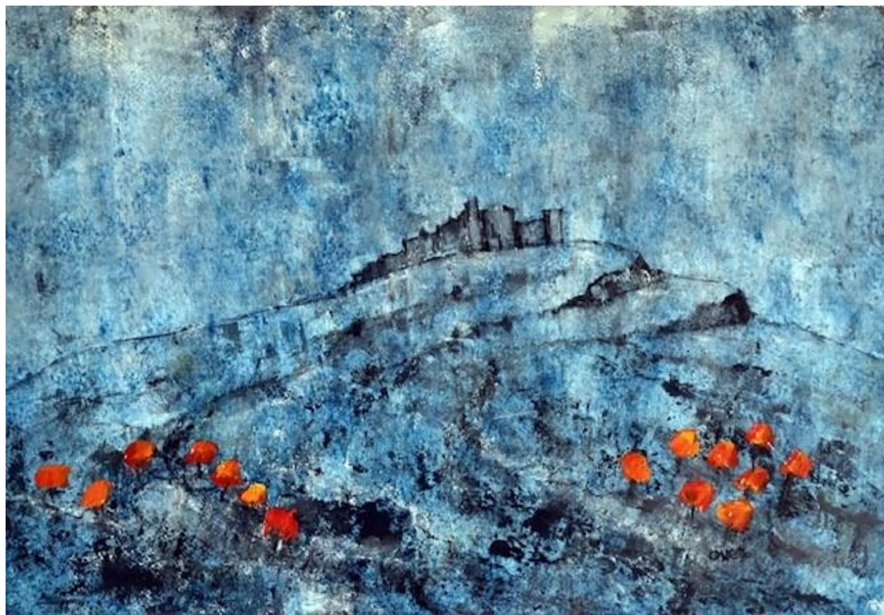
Carreg Cennen – acrylics on paper, 91 x 70cm framed - £795