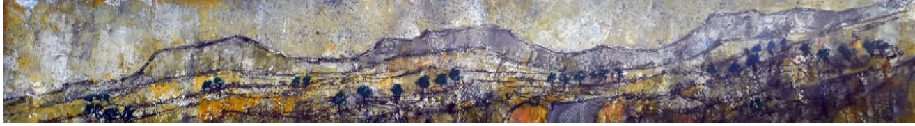
Rhinos – acrylics on paper, 120 x 42cm framed - £725