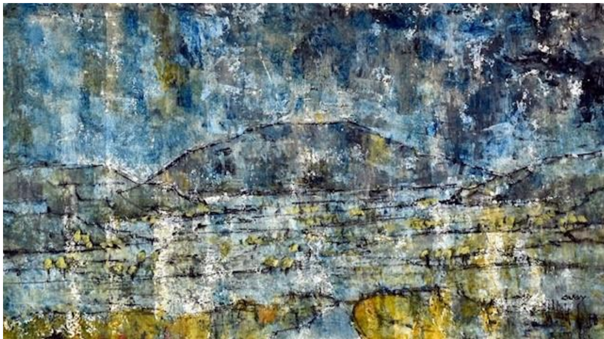
Path to the Promised Land – acrylics on paper, 100 x 72cm framed - £850