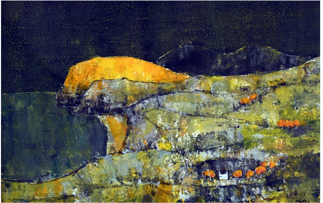
Lley – acrylics on paper, 80 x 60cm framed - £695