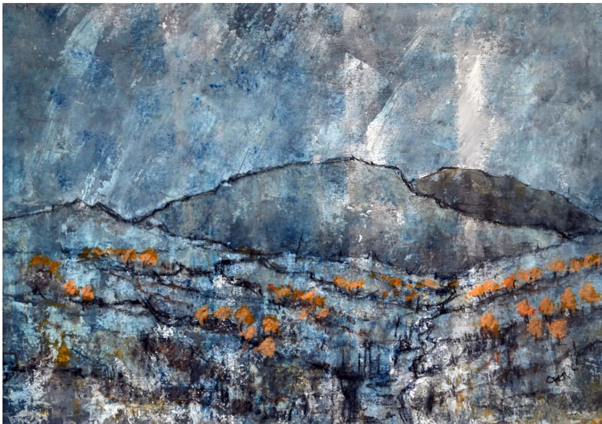
Cadair Idris – acrylics on paper, 80 x 70cm framed - £725