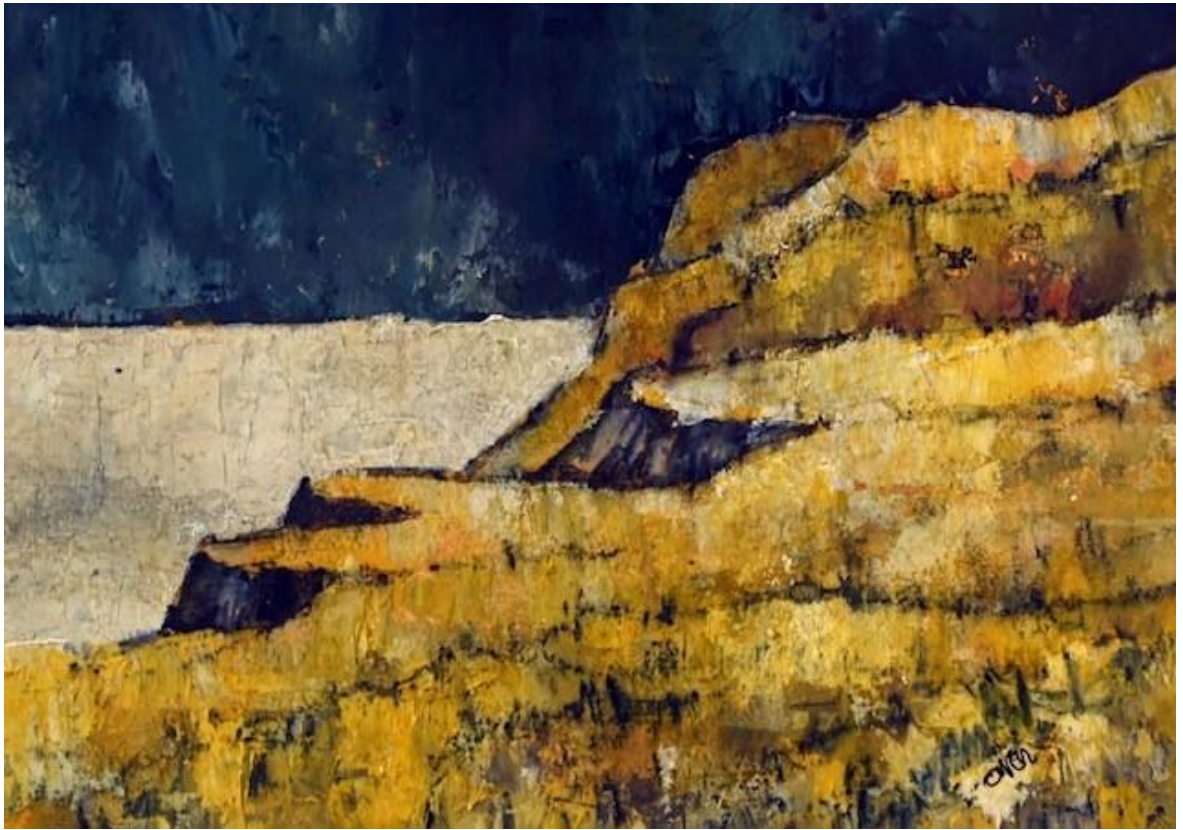
Lleyn Coast – acrylics on paper, 60 x 50cm framed - £495