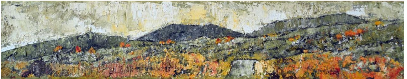
Cwm Croesor – acrylics on canvas, 104 x 24cm framed - £695