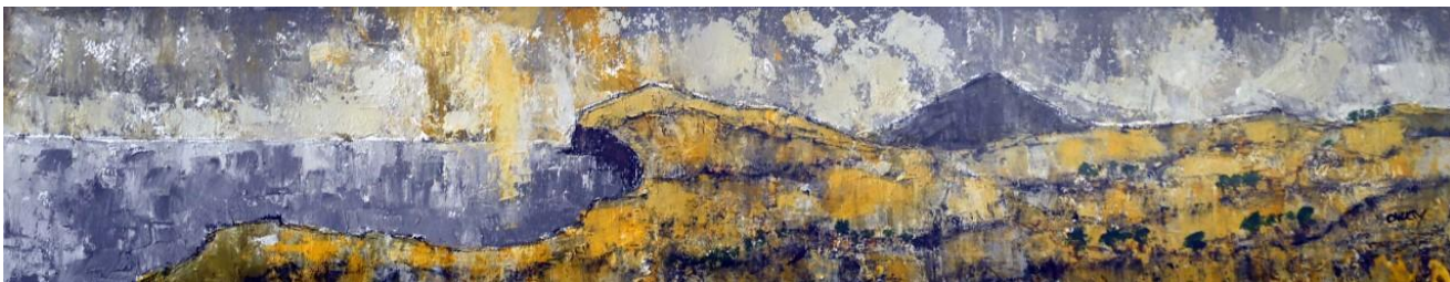
Lleyn Landscape - acrylics on paper, 120 x 45cm framed - £750