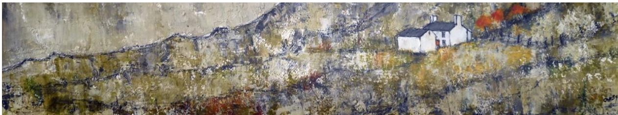
Snowdonia Farm – acrylics on paper, 120 x 45cm framed - £750