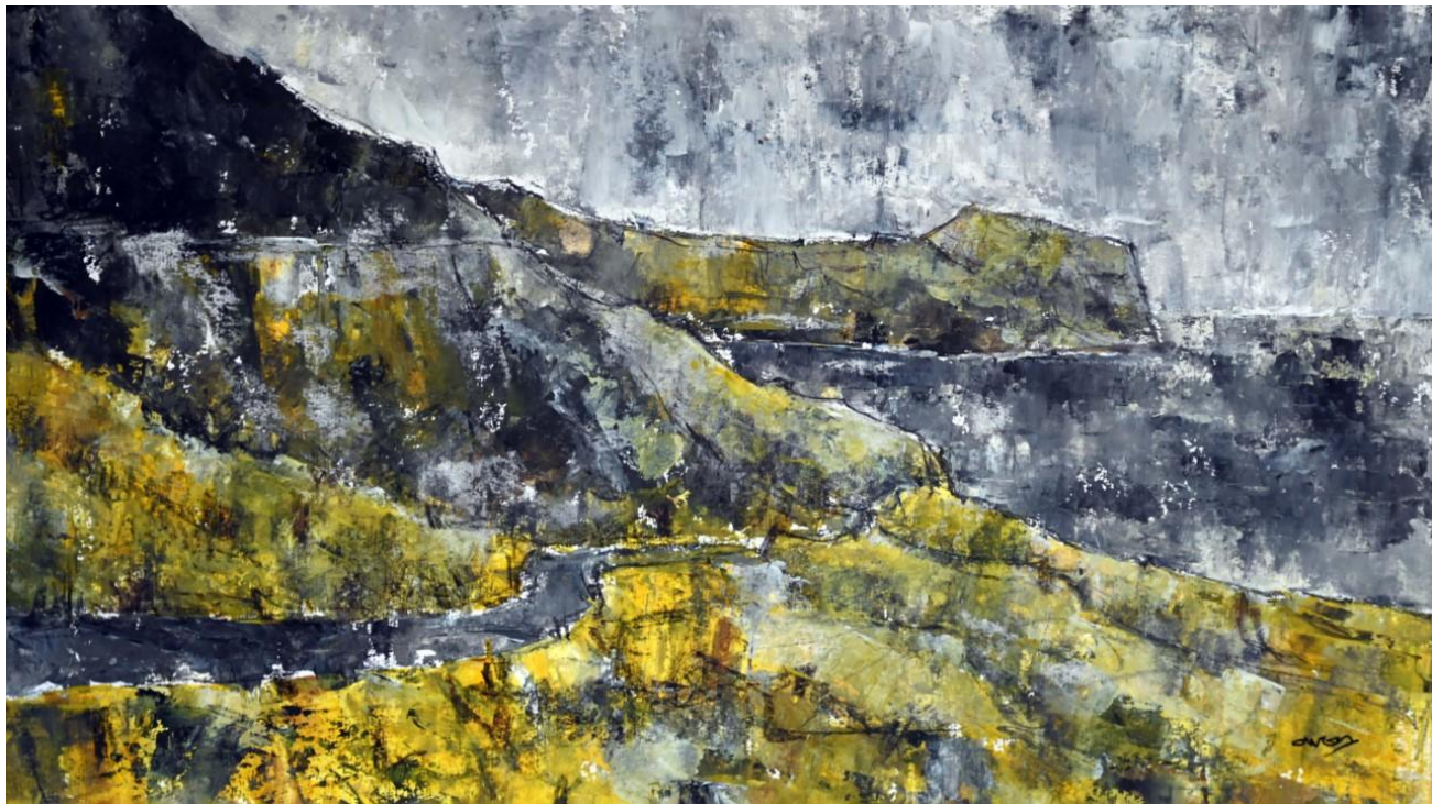
Path to the Sea, Llyn – acrylics on paper, 100 x 70cm framed - £825