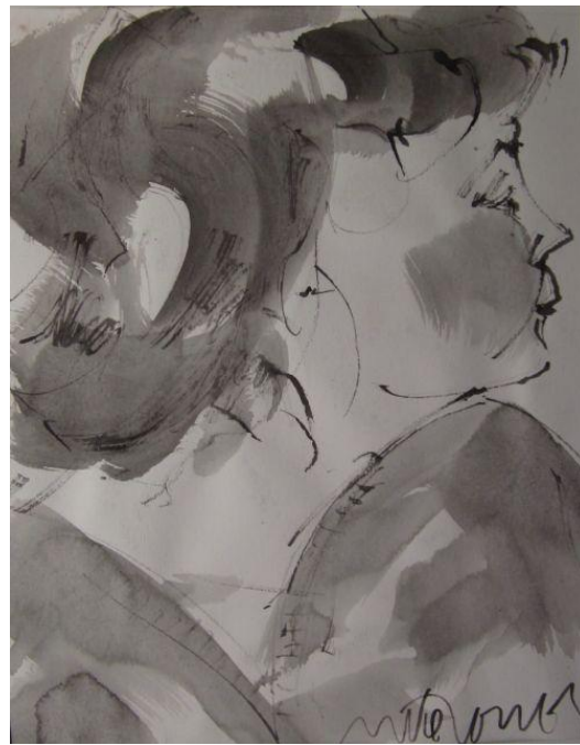
22. Head of a Woman – Ink wash, 44 x 40cm framed - £495