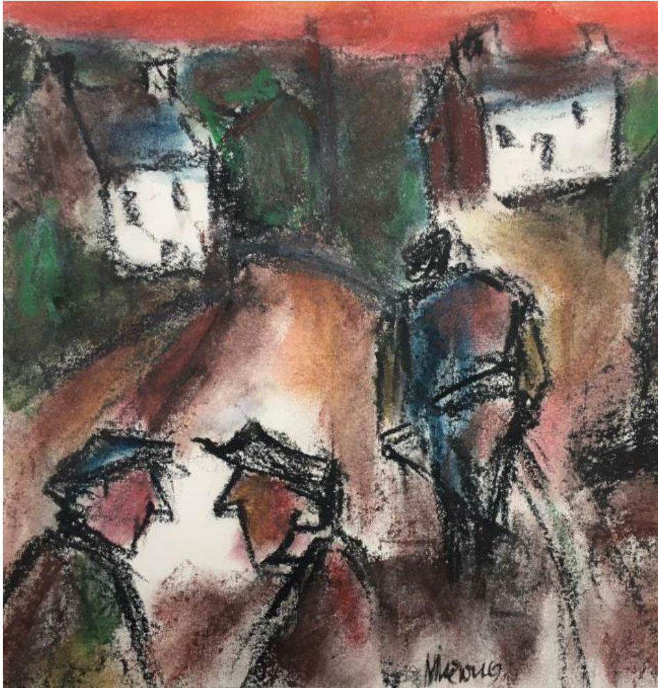
17. The Road Home – oil pastel and ink wash, 41 x 41cm framed - £550