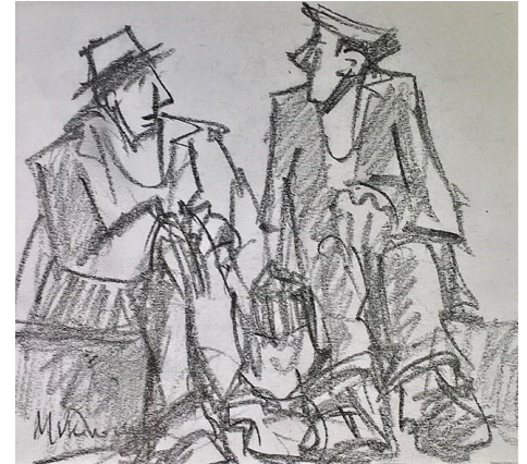
20. Two Men Seated - graphite, 38 x 40cm framed - £350