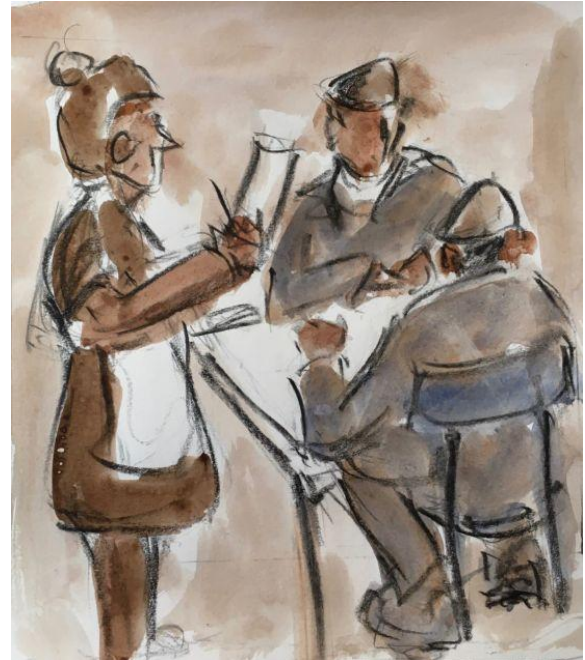
16. Men in Cafe – Litho crayon and ink wash, 41 x 38cm framed - £525