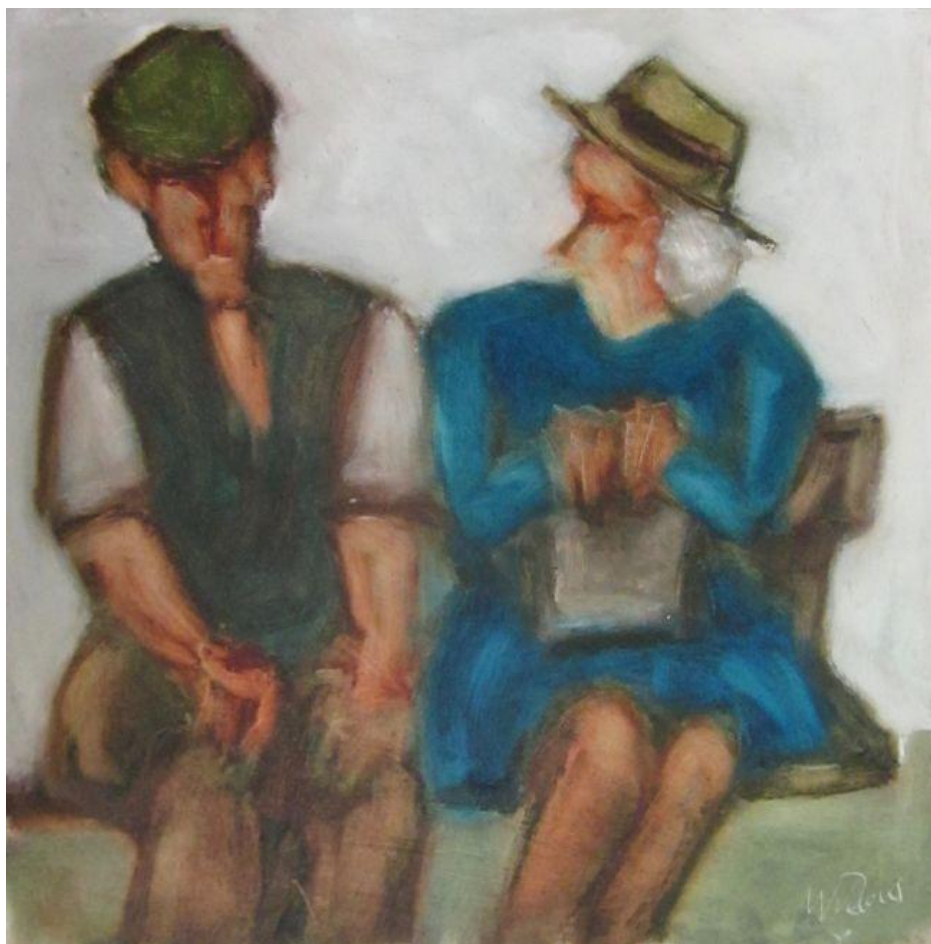
27. Couple seated - Oil on board, 47 x 47cm framed - £1,200