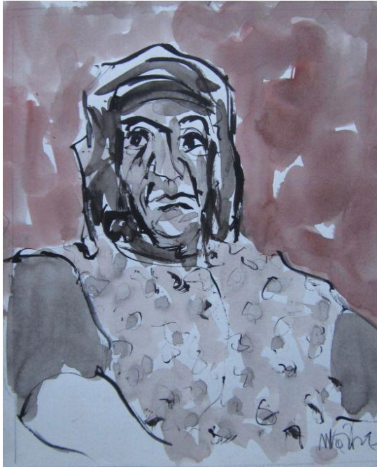
15. Cocklewoman - Ink wash, 45 x 50cm framed - £525