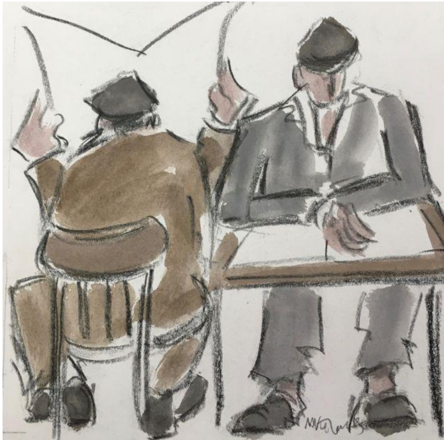
14. Reading Room – Litho crayon and ink wash, 43 x 44cm framed - £525