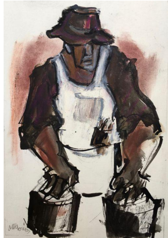
13. Mr Price, the painter – Ink and pastel, 49 x 44cm framed - £600