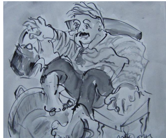
23. Farmer with Stick – oil on board, 34 x 39cm framed - £750