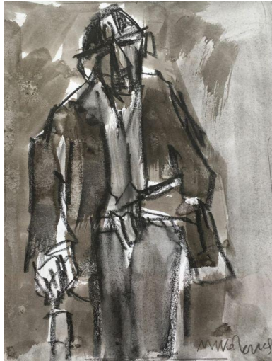
19. Collier - Litho crayon / ink wash, 41 x 36cm framed - £500