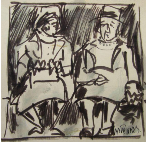
18. Seated Ladies - Pen, 37 x 37cm framed - £350