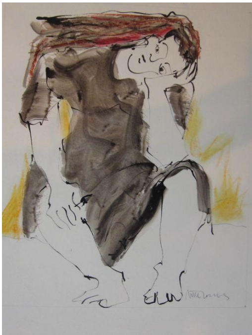
21. Seated Woman – Ink wash, 48 x 43cm framed - £600