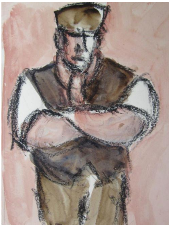
1. Steelworker II, crayon and ink wash, 44 x 39cm framed - £550