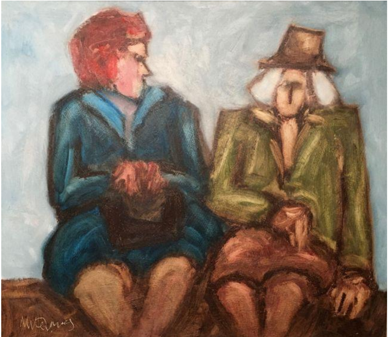
3. Seated Ladies - Oil on board, 52 x 57cm framed - £1,400