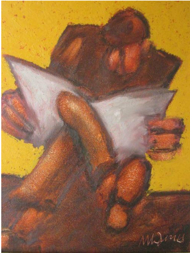
12. Reader – oil on board, 44 x 39cm framed - £950