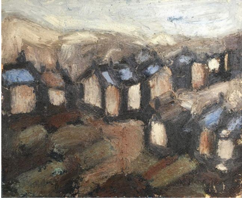
11. Tai Top - Oil on board, 36 x 41cm framed - £800