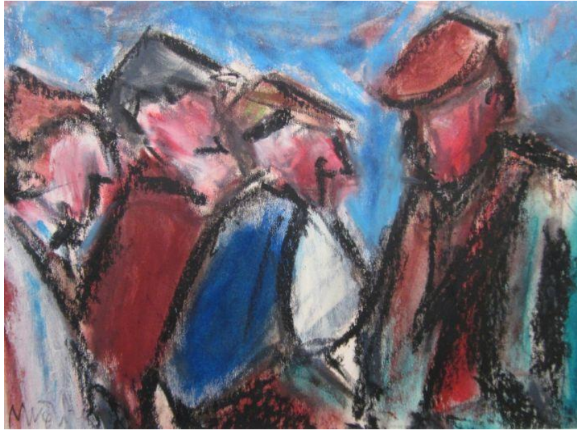
6. Farmers Mart - Oil pastel and ink wash, 34 x 39cm framed - £550