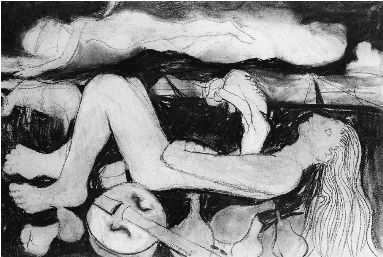
1 front cover 2 above