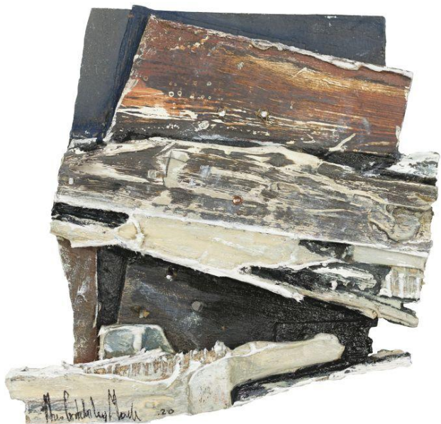
8. Rosebush Rock Crevice Oil and Wood on Panel, 37cm x 39cm framed - £500