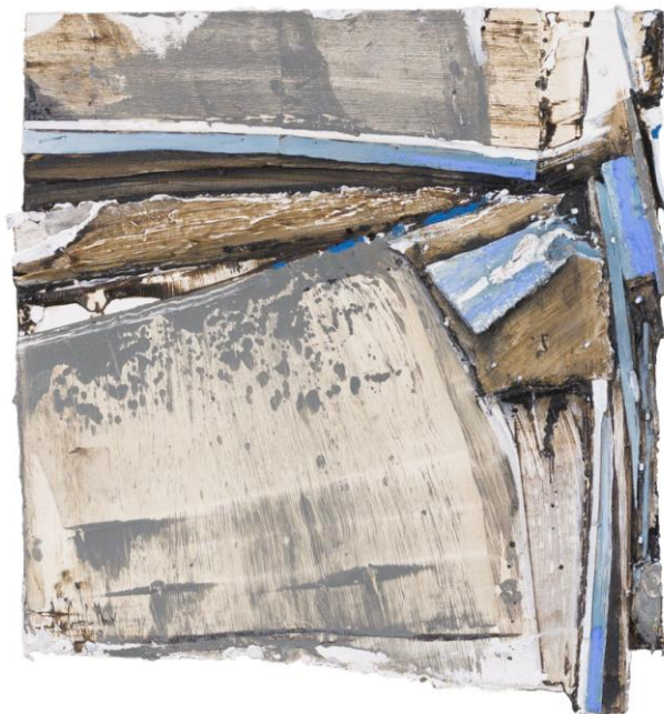
2. Concrete and Stream 2 - Oil and Wood on Panel, 50cm x 51cm framed - £800