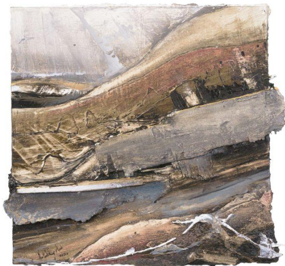
9. Scarred Rosebush Valley - Oil and Wood on Panel, 50cm x 51cm framed - £800