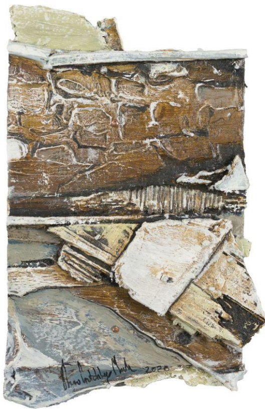
12. Abergwaun Harbour Wall - Oil and Wood on Panel, 35cm x 41cm framed - £500