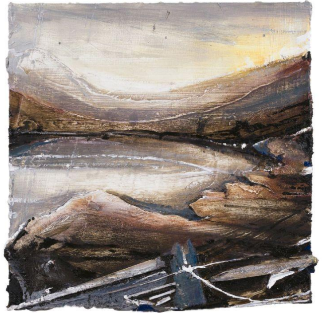
5. Orange Pit Banks - Oil and Wood on Panel, 50cm x 51cm framed - £800