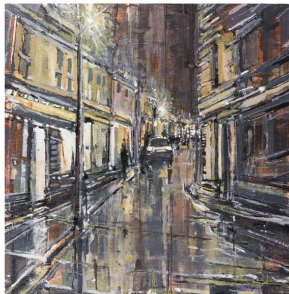
7. Midnight in Fishguard - Oil on Panel, 48cm x 48cm framed - £700