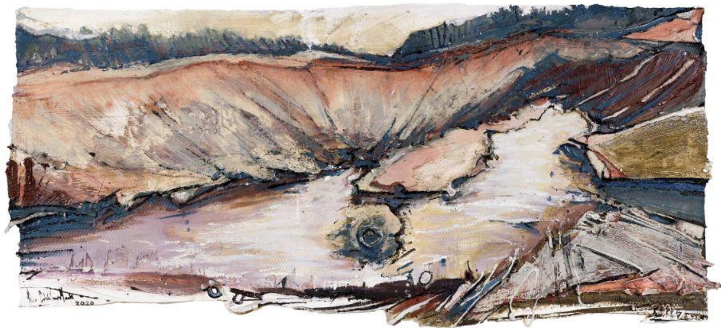
20. East Wheal Maid - Oil and Wood on Panel, 106cm x 61cm framed - £1,900