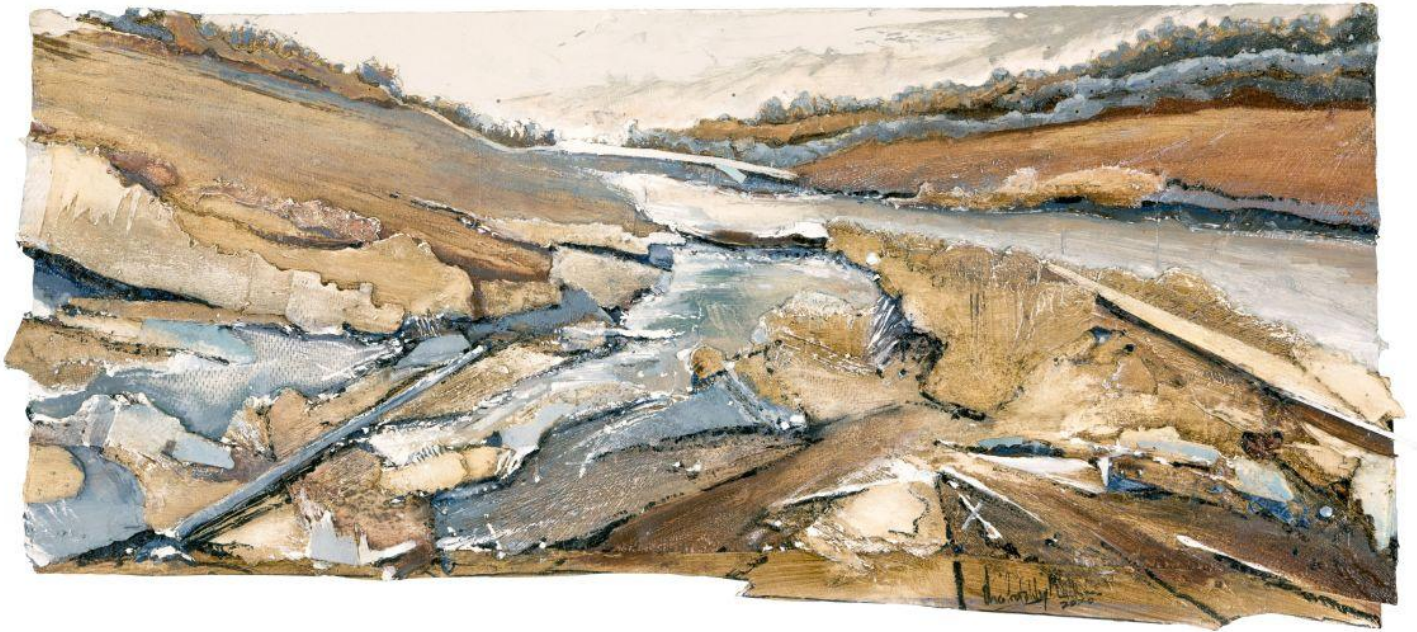
3. Copper Stained Stream - Oil and Wood on Panel, 106cm x 61cm framed - £1,900