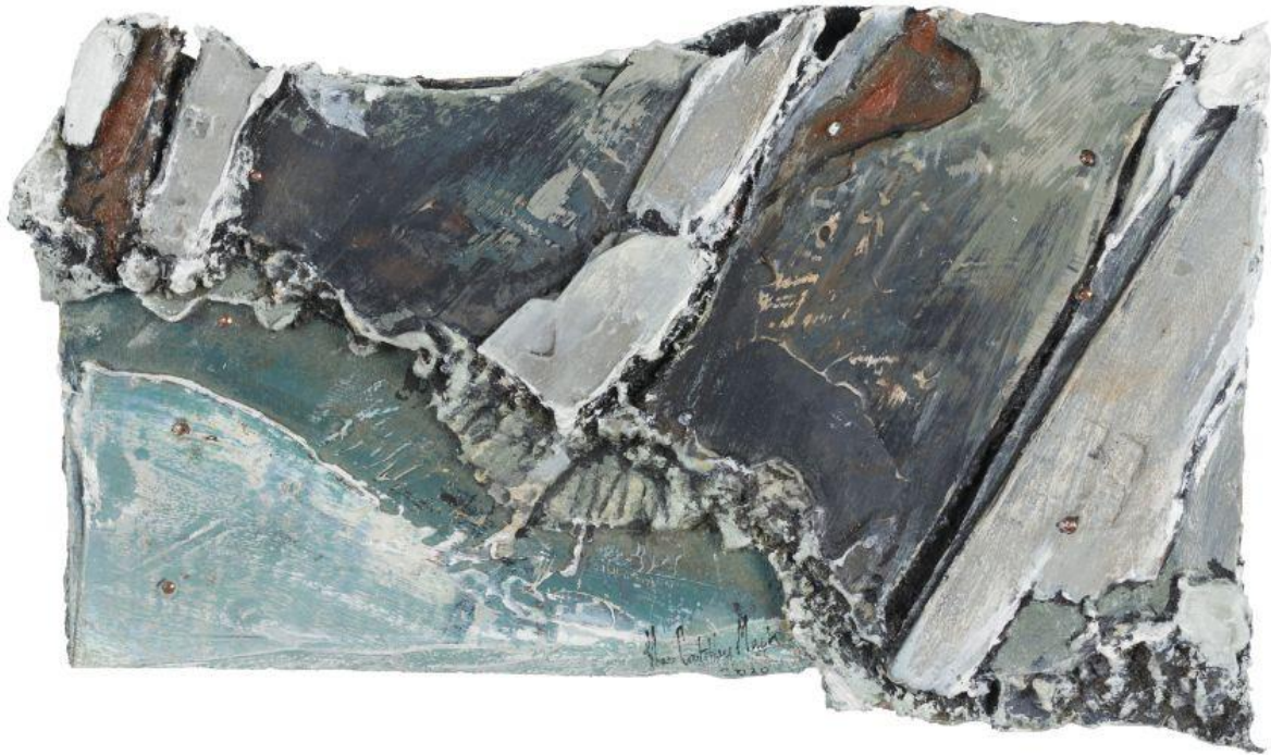
13. Cliff Walk Edge - Oil and Wood on Panel 49cm x 40cm framed - £650