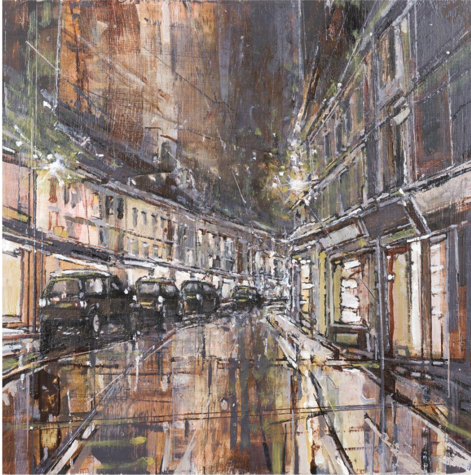
16. Cardigan High St. Nocturne - Oil on Panel, 48cm x 48cm framed - £700