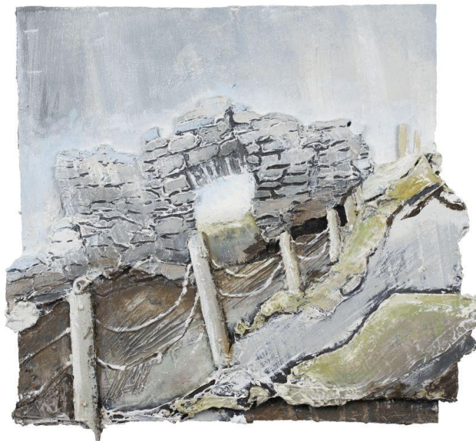
15. Fishguard Fort Oil and Wood on Panel 62cm x 61cm framed - £800