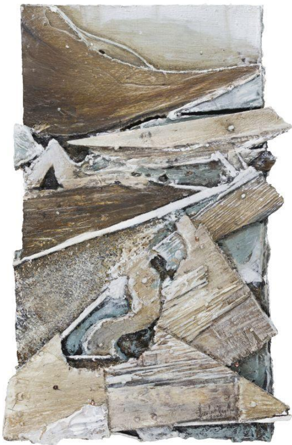
14. Stream Through Rosebush Rocks - Oil and Wood on Panel, 41cm x 51cm framed - £700