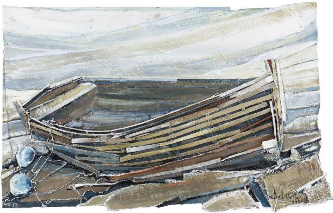
21. Ar Yr Afon - Oil and Wood on Panel, 92cm x 70cm framed - £1,900