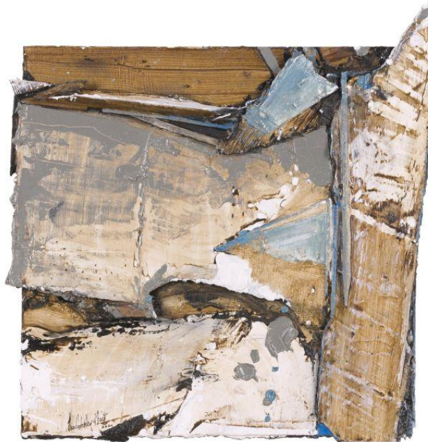
1. Earth and concrete - Oil and Wood on Panel, 50cm x 51cm framed - £ 800