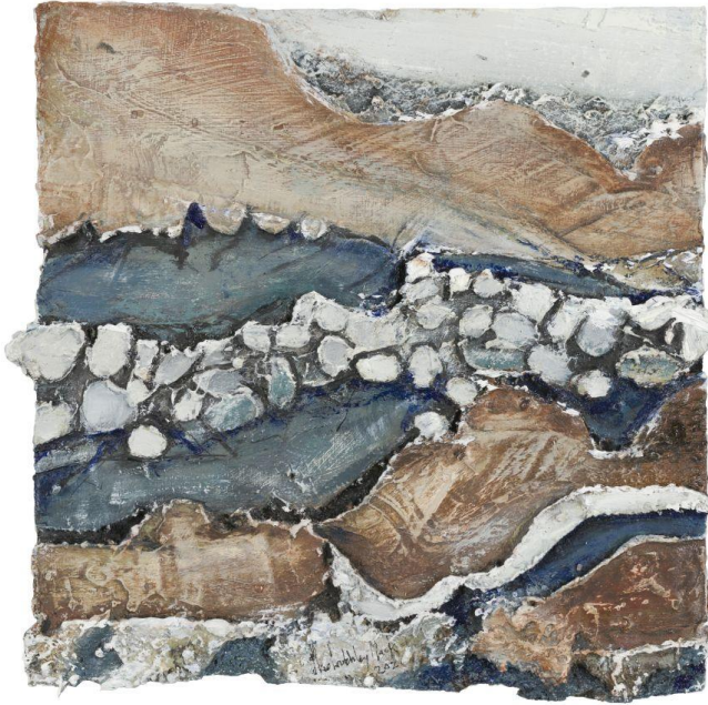
4. Mineral Veins - Oil and Wood on Panel, 43cm x 44cm framed - £700