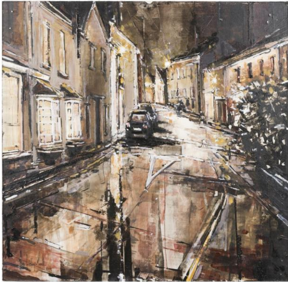
17. Upper West St, Newport - Nocturne Oil on Panel, 55cm x 55cm framed - £800