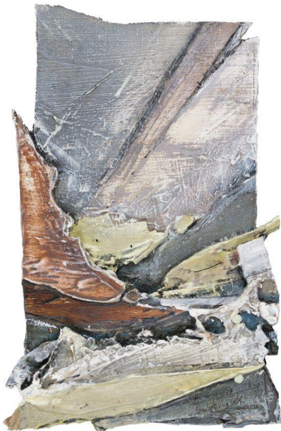
11. Copper Deposit, Sygun Mine - Oil and Wood on Panel, 51cm x 41cm framed - £700