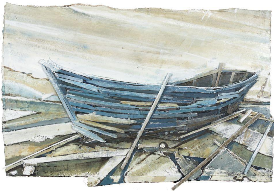
10. Cychod Blinedig - Oil and Wood on Panel, 102cm x 77cm framed - £1,900