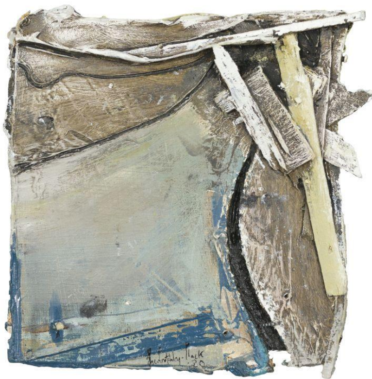
19. Tidal River Bank - Oil and Wood on Panel, 39cm x 37cm framed - £500