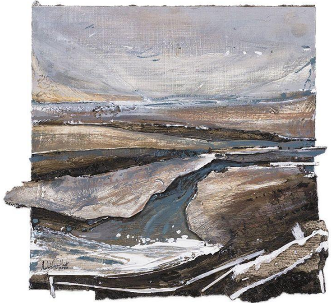
18. Tailings Stream - Oil and Wood on Panel, 50cm x 51cm framed - £800