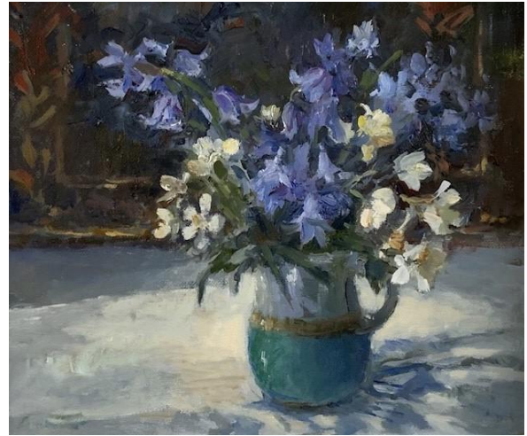
● 5. Bluebells and Spring Blossom – oils on canvas, 10" x 12" - £1,250