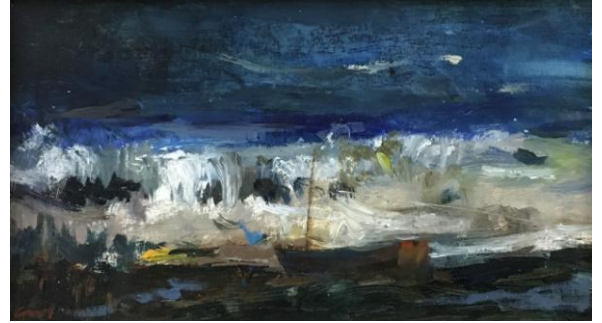
14. Surf and Boat – oils on canvas, 7" x 10" - £1,000