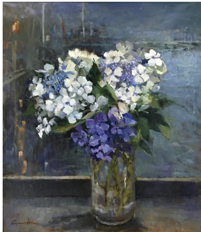
● 35. Harbour window Hydrangeas – oils on canvas, 14" x 16" – £2,500