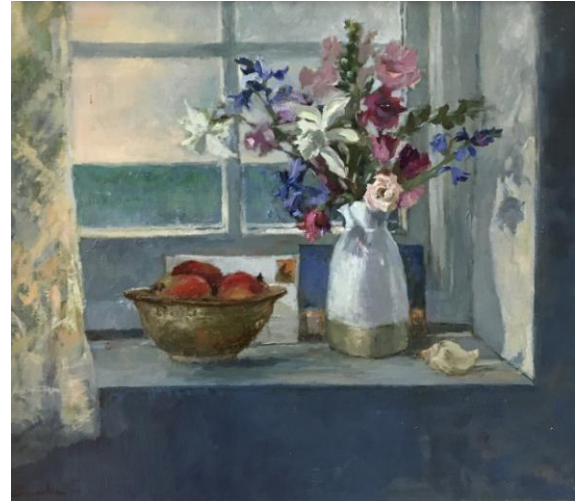
● 30. Seaside Windowsill – oils on canvas, 16" x 18" - £3,000