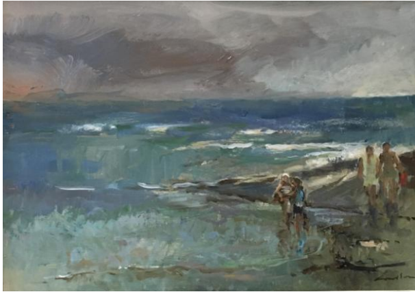
28. After the Picnic – oils on canvas, 11" x 142 - £1,550