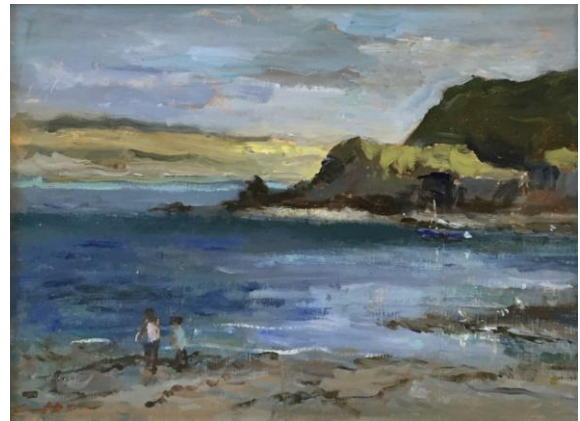
41. Sunlight Cwm Yr Eglwys - Oils on canvas, 6" x 8" - £750