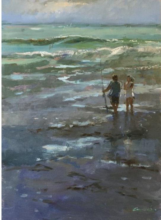
36. Green Sea and Wet Sands – oils on canvas, 10" x 14" - £1,550