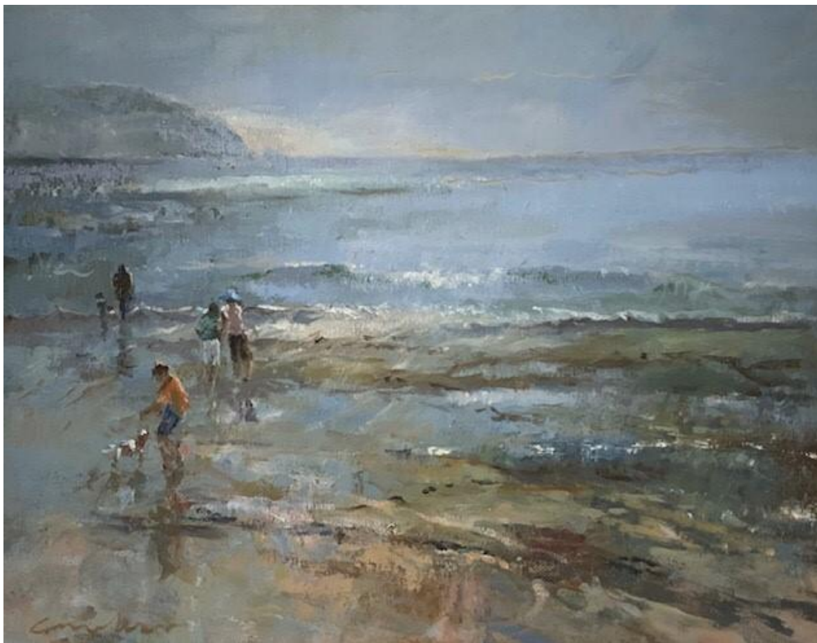
● 2. Afternoon on the Sands – oils on canvas, 11" x 14" - £1,650