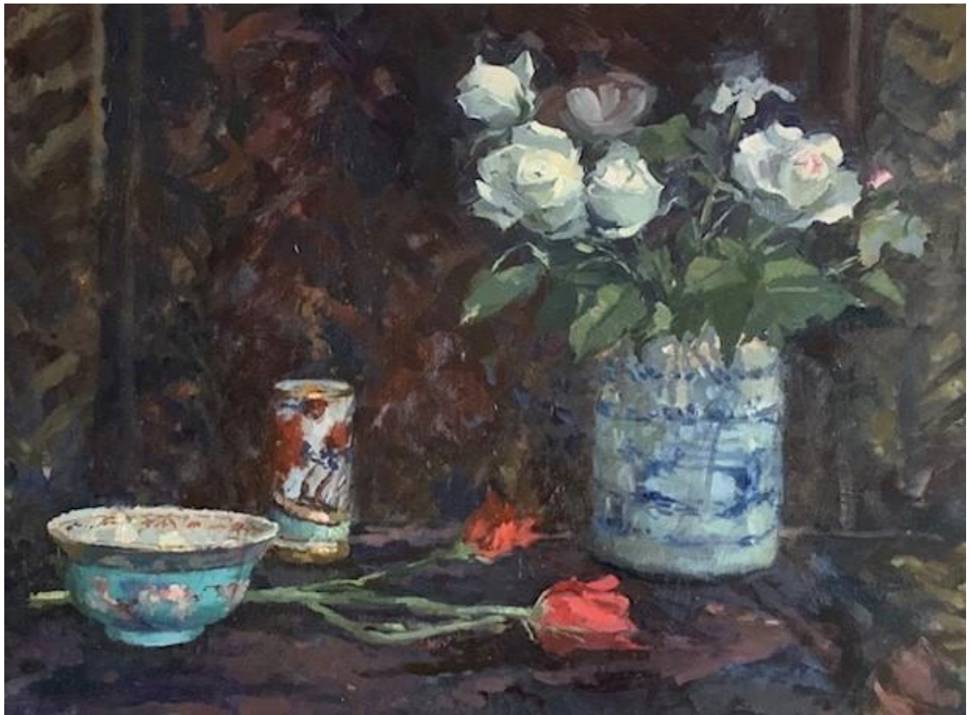
12. Rose and Red Tulips – oils on canvas, 13" x 17" - £2,600