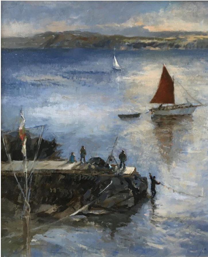
● 16. Sailing Home – oils on canvas, 20" x 24" - £6,950