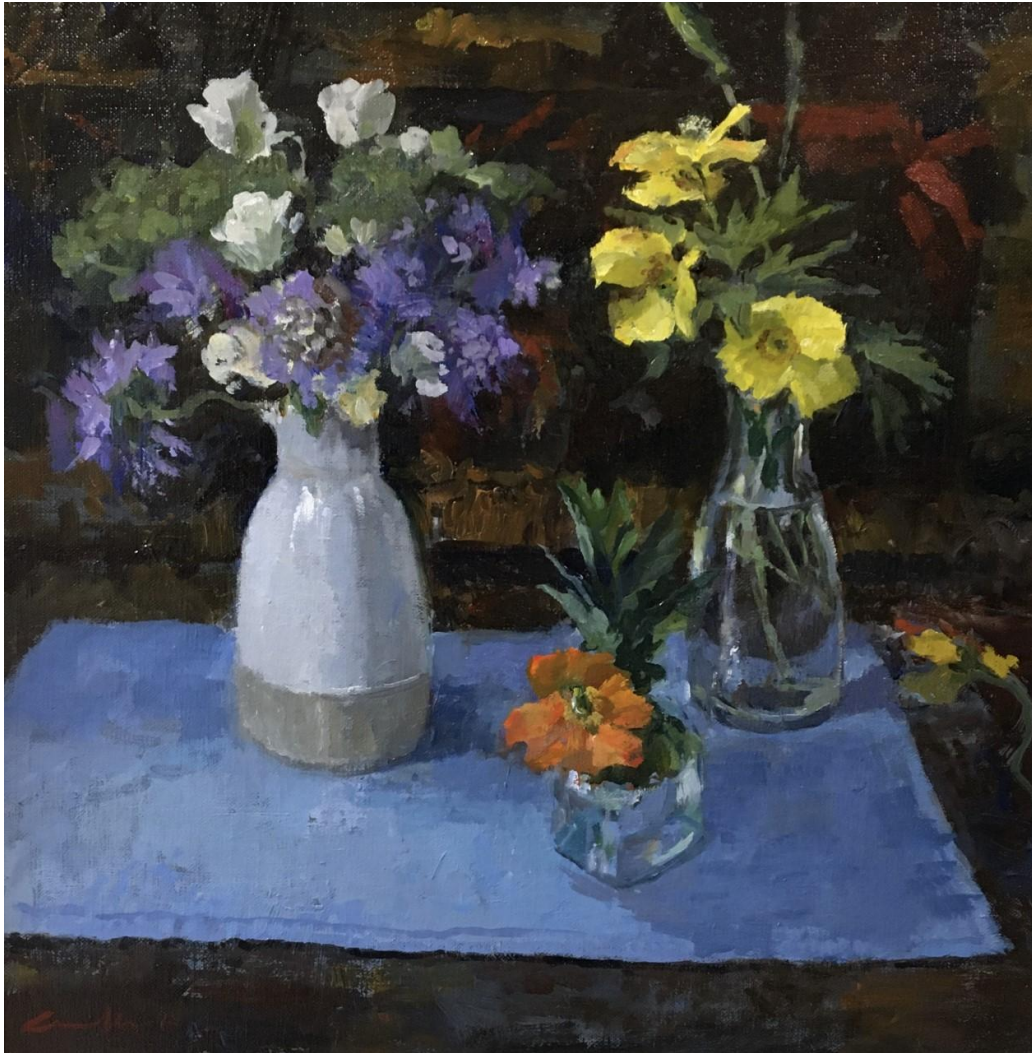
● 27. Welsh Poppies and Spring Flowers – oils on canvas, 16" x 16" - £3,000