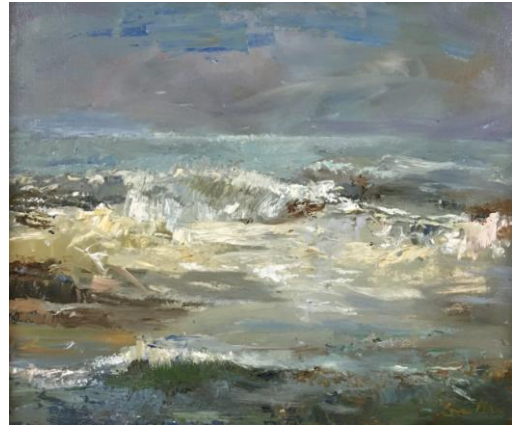
10. Surf and Sand Newport – oils on canvas, 14" x 16" - £2,500