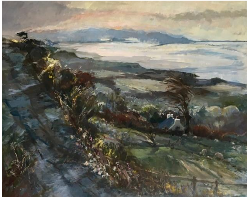
32. Fishguard Bay – oils on canvas, 24" x 30" – £7,750