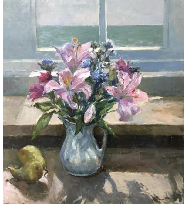
● 37. Lilies by the Window – oils on canvas, 16" x 18" - £3,000