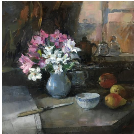
● 11. Evening Light – oils on canvas, 16" x 16"- £3,000