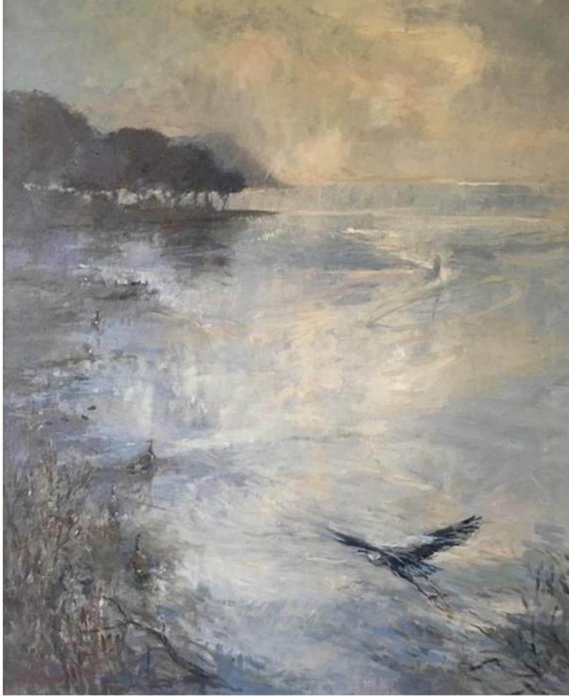
13. Heron's Flight – oils on canvas, 27" x 33" - £9,500