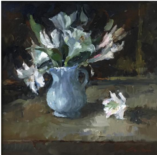
● 29. The Blue Jug – oils on canvas, 10" x 10" - £1,100