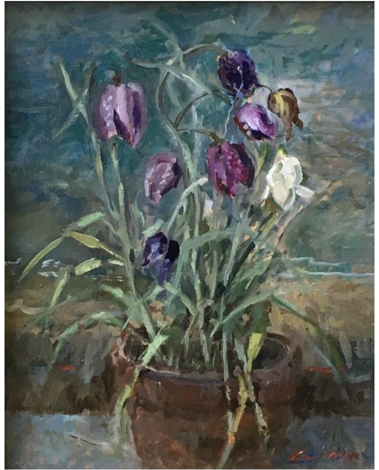
● 43. Fritillaria – oils on canvas, 8" x 10" - £950