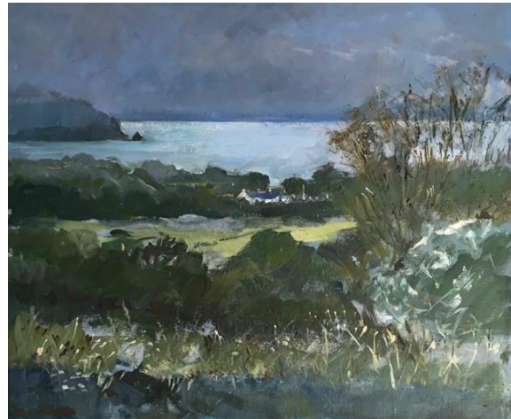
● 19. Sunrise Cwm Yr Eglwys – oils on canvas, 18" x 20" - £4,250