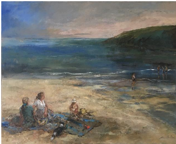
4. Summer Picnic on the Sands – oils on canvas, 26" x 32" - £7,950