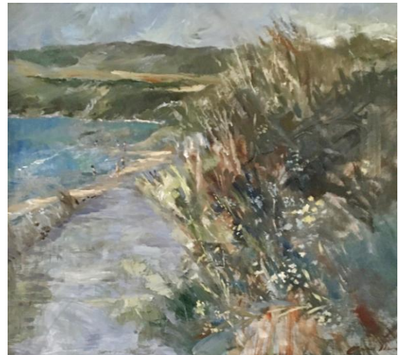
31. Path to the Sands – oils on canvas, 20" x 22" - £6,500