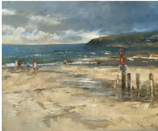
39. Below the Dunes - Oils on canvas, 25" x 30" - £7,750