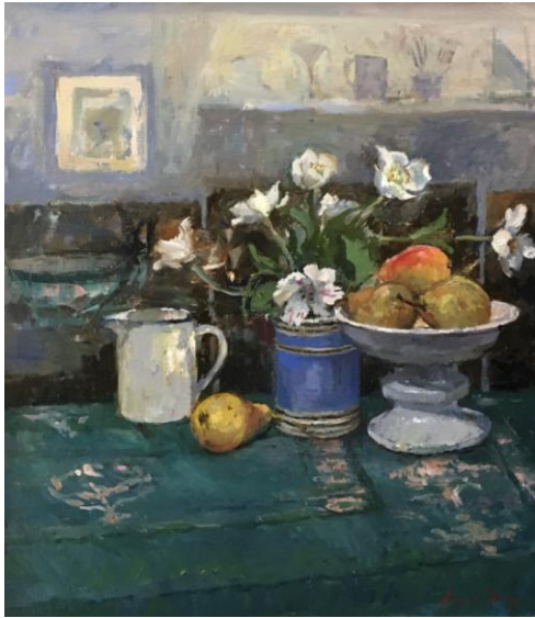
8. The Kitchen Table – oils on canvas, 16" x 18" - £3,000