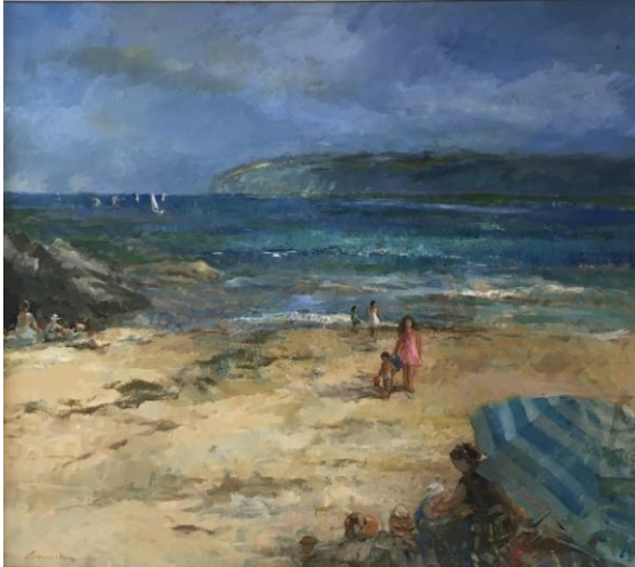
3. Sailing Cwm Yr Eglwys – oils on canvas, 30" x 34" - £8,950