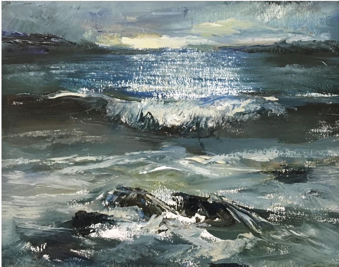
● 1. The Wave, Whitesands – oils on canvas, 14" x 16" - £2,500