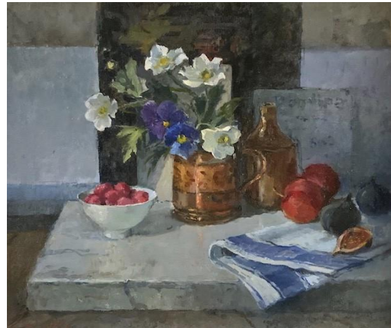
6. Fruit and Flowers – oils on canvas, 16" x 18" framed - £3,250