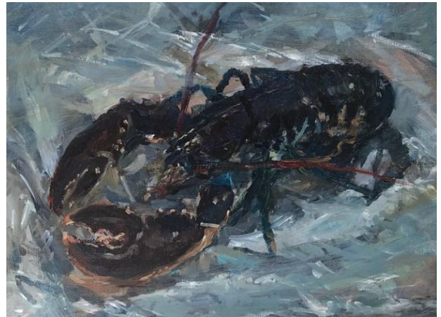
● 18. Lobster – oils on canvas, 12" x 14" - £1,650