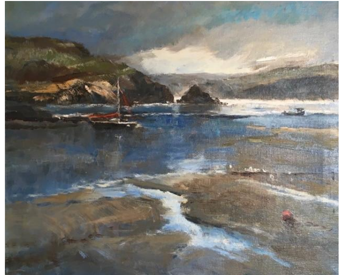
25. Cat Rock Low Tide – oils on canvas, 20" x 24" - £7,150