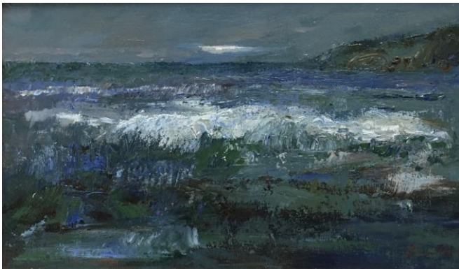
24. Breaking Wave – oils on canvas, 7" x 12" - £1,100