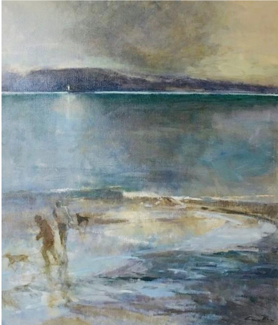
7. Lighthouse - oils on canvas, 20" x 30" - £7,500