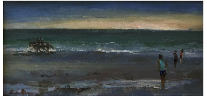
17. Evening Riders by the Sea - Oils on canvas, 5" x 9" - £750