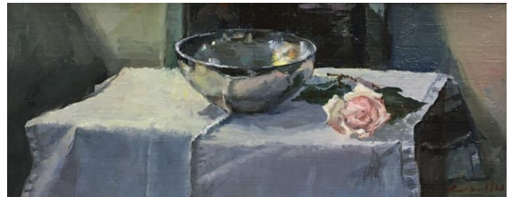
● 26. Silver Bowl and Rose - oils on canvas, 6"x 14" - £1,100