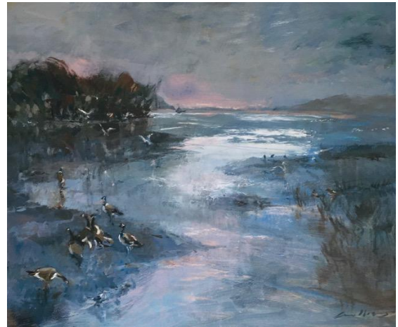
● 40. Canada Geese on the Estuary – oils on canvas, 22" x 24" - £7,250