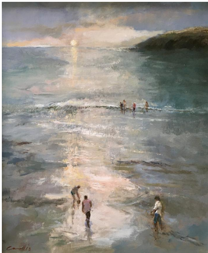
● 44. Sunset – oils on canvas, 20" x 24" - £6,950