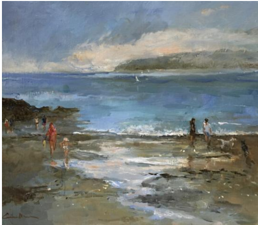
● 38. Summer Breeze – oils on canvas, 12" x 14" - £1,750