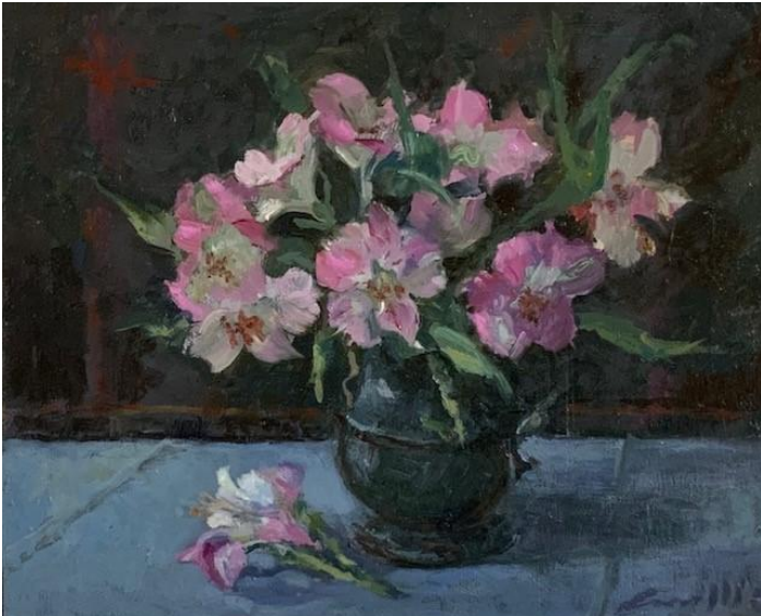
● 23. Alstroemerias – oils on canvas, 6" x 10" - £950