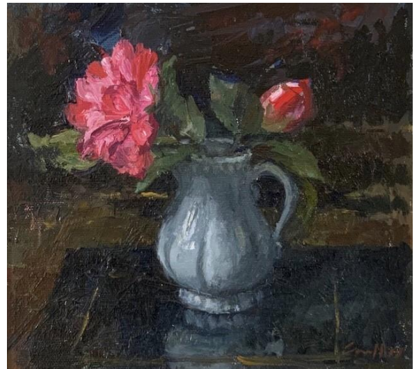
15. Red Camellia's – oils on canvas, 8" x 8" - £950