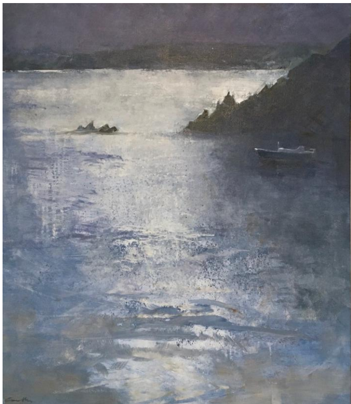
34. Early Morning Light Cwm Yr Eglwys – oils on canvas, 30" x 34" - £8,950