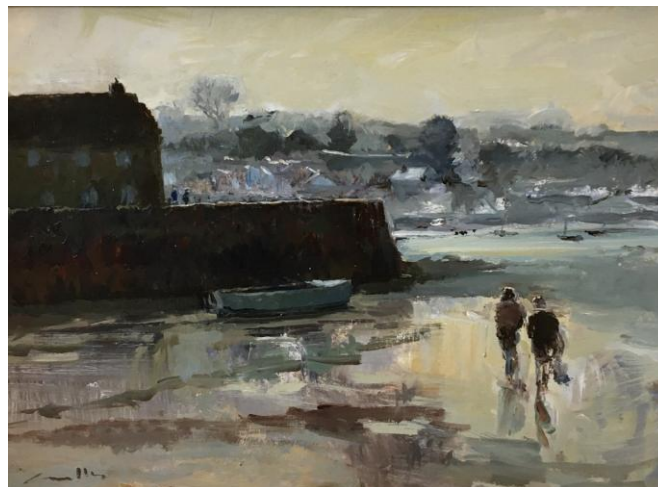
● 33. Evening Walkers on the Parrog – oils on canvas, 9" x 12" -