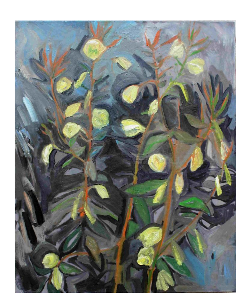
11. Moths Moon Flower 1 – oils on linen, 100cm x 82cm framed - £2,950