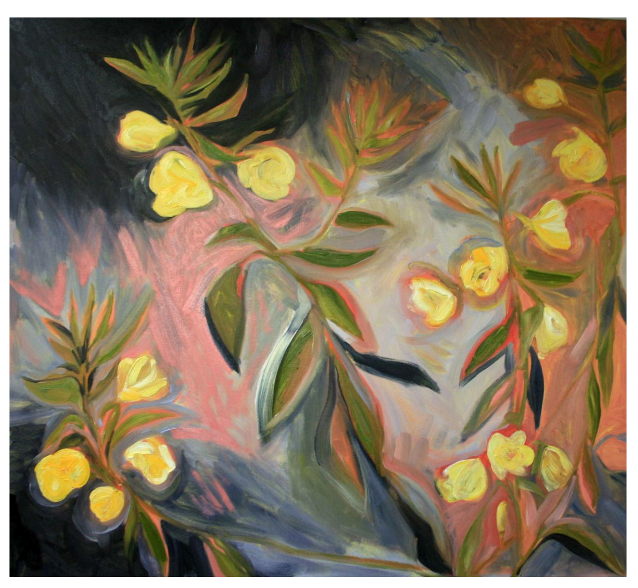
8. Moths Moon Flower 2 – oils on linen, 110cm x 120cm framed - £3,250