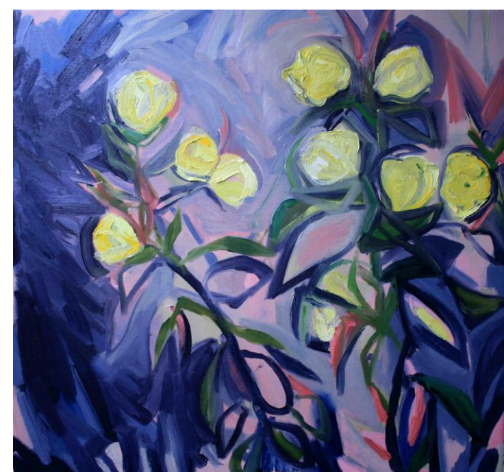
17. Evening Star 1 – oils on linen, 71cm x 77cm framed - £2,650