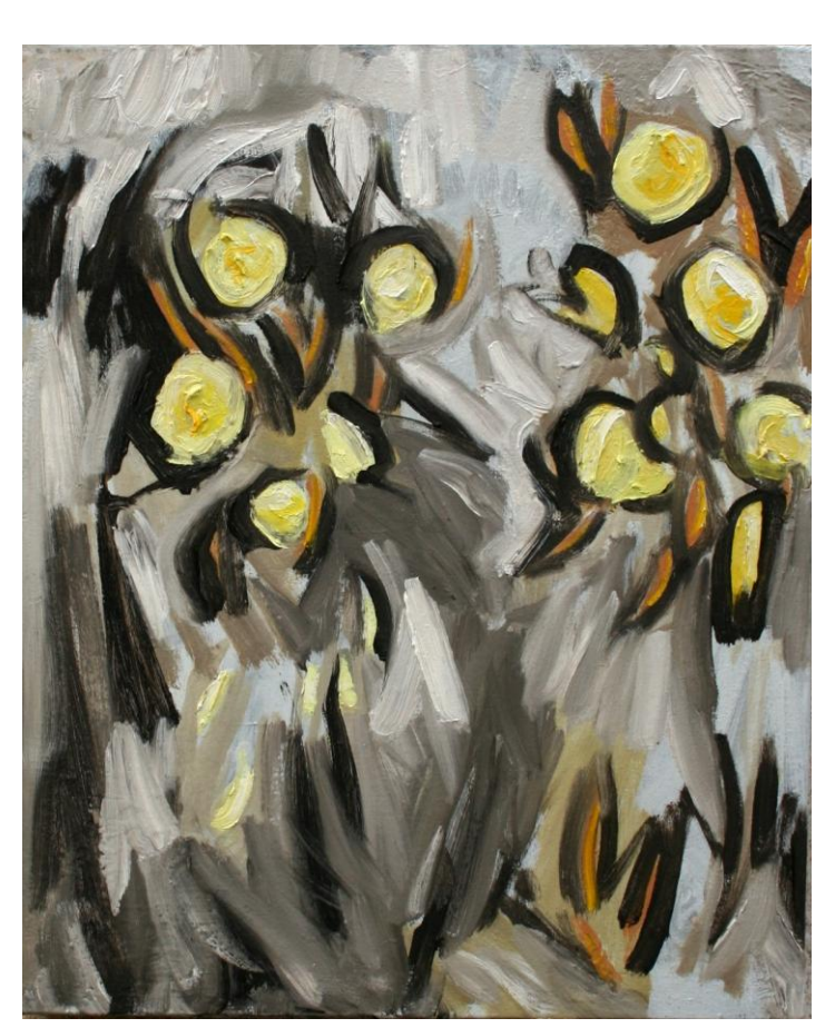
12. Vespertine Yellow 3 \, – oils on linen, 61cm x 50cm framed - £1,750