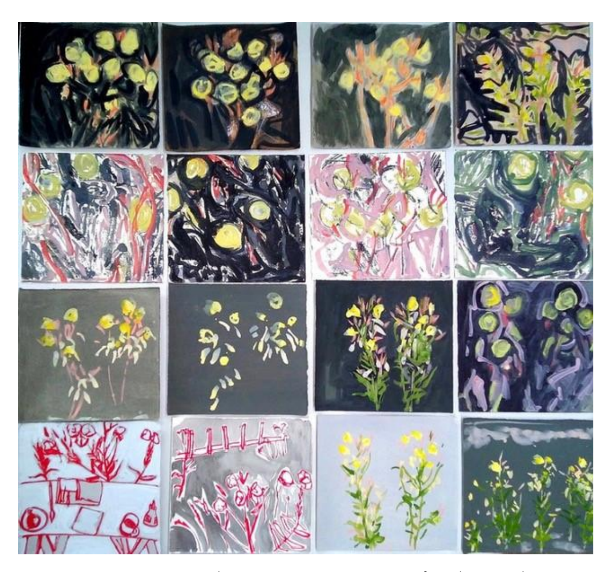
3. Evening Primrose Works on Paper 1 to 17 - 24cm x 26cm unframed - £495 each