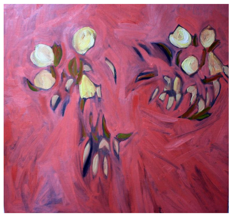
4. Moths Moon Flower 4 - oils on linen, 56cm x 61cm framed - £1,950