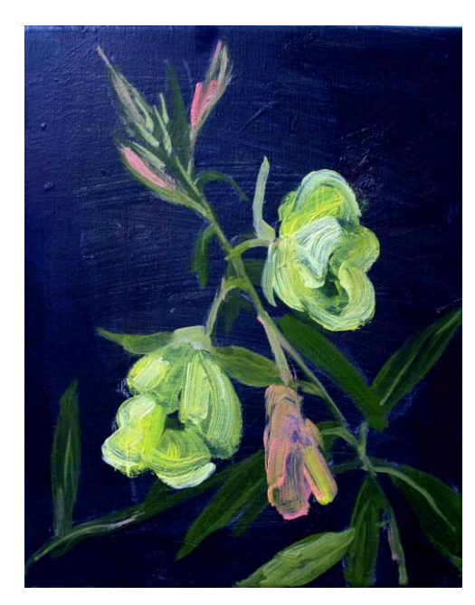
14. Moon Flower 1 – oils on linen, 30cm x 24cm framed - £550