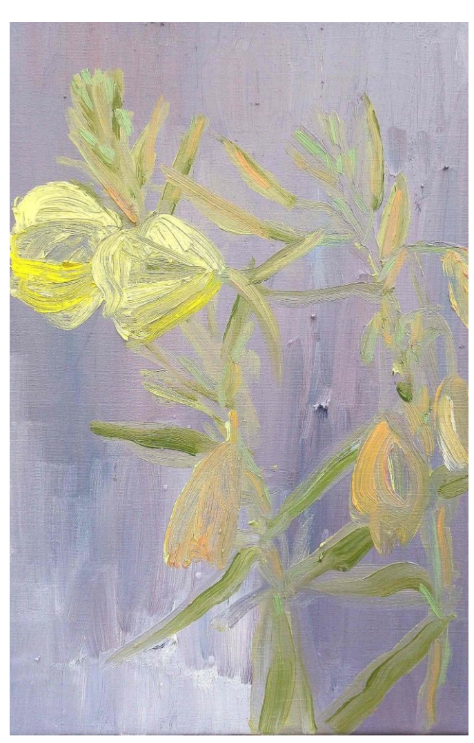
2. Night Willow Herb 2 – oils on linen, 42cm x 27cm framed - \pm 650