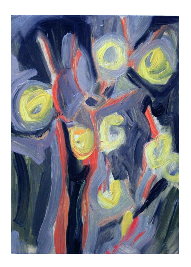
1. Moths Moon Flower 5 – oils on birch, 18cm x 13cm framed - £350 \,