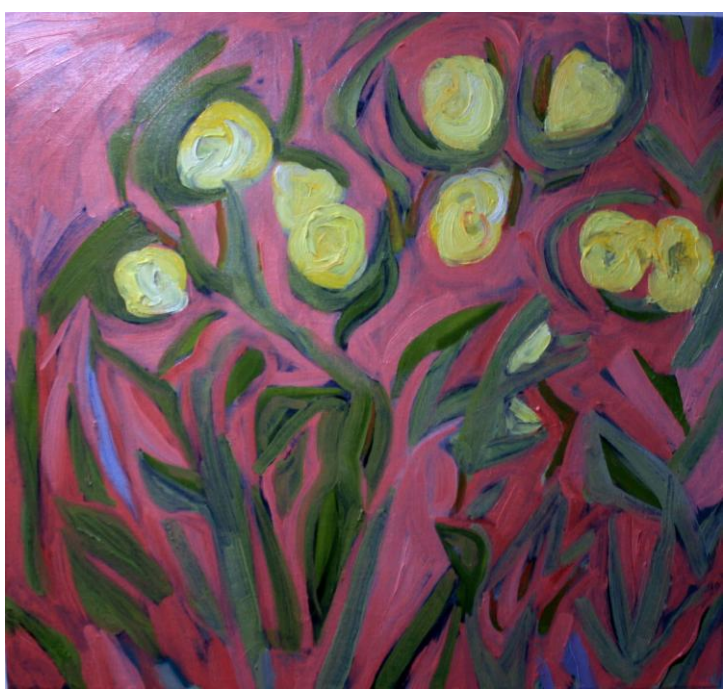
6. Moths Moon Flower 3 – oils on canvas, 56cm x 61cm framed - £1,950