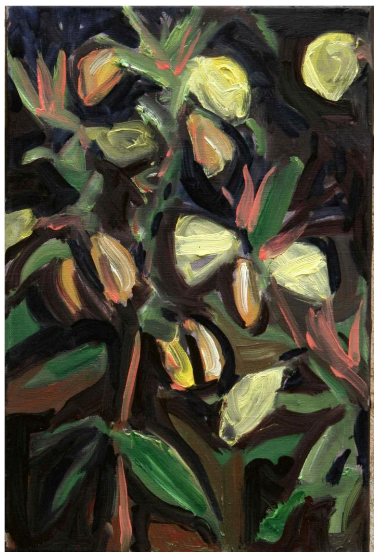
9. Night Willow Herb 3 – oils on linen, 41cm x 27cm framed - £650