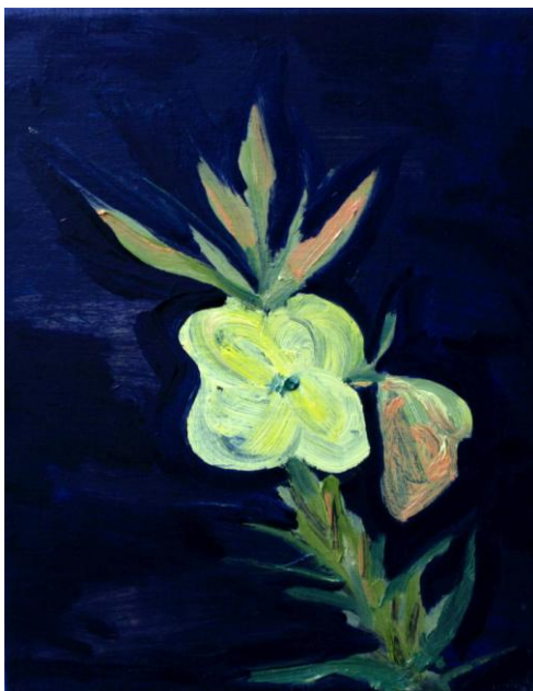
14. Moon Flower 1 – oils on linen, 30cm x 24cm framed - £550