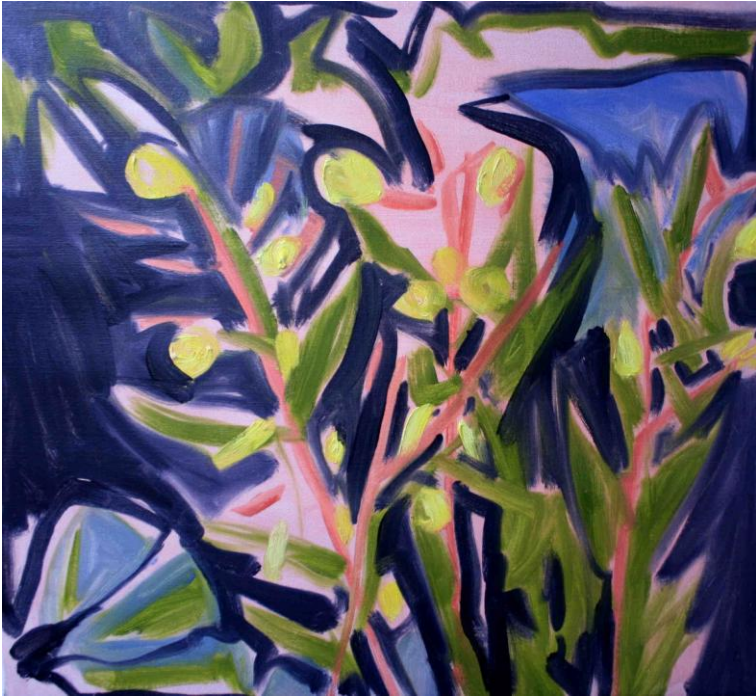
4. Moths Moon Flower 4 - oils on linen, 56cm x 61cm framed - £1,950