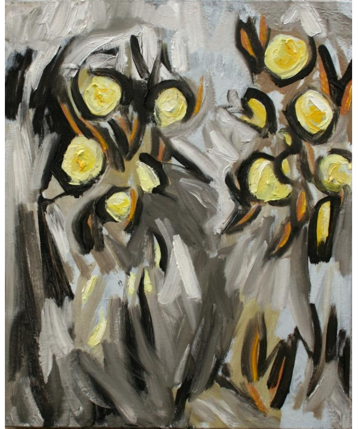
12. Vespertine Yellow 3 – oils on linen, 61cm x 50cm framed - £1,750