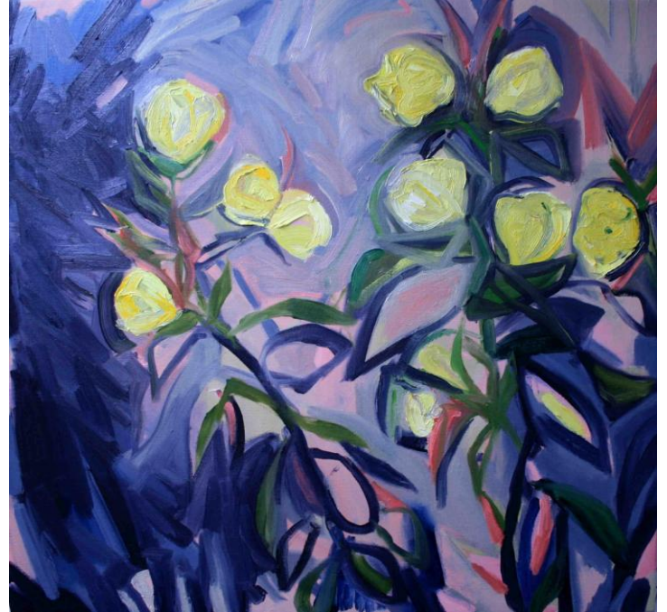
18. Evening Star 2 – oils on linen, 71cm x 77cm framed - £2,650