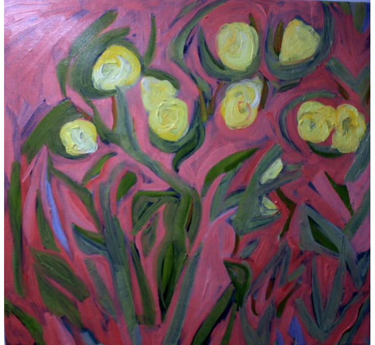
7. Vespertine Yellow 1 – oils on linen, 67cm x 72cm framed - £2,350