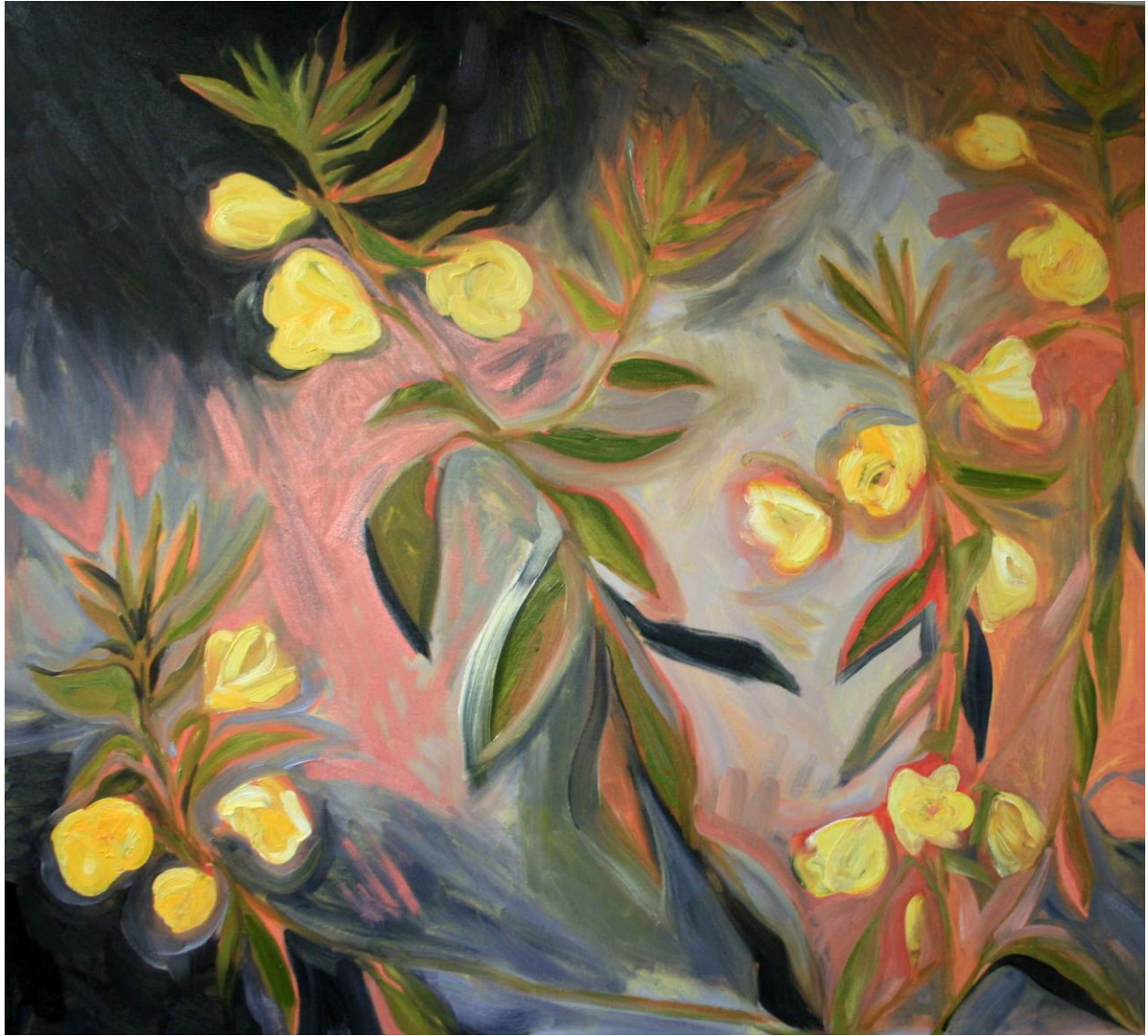
8. Moths Moon Flower 2 – oils on linen, 110cm x 120cm framed - £3,250