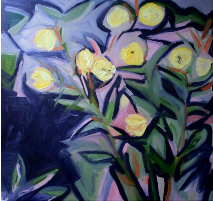
17. Evening Star 1 – oils on linen, 71cm x 77cm framed - £2,650