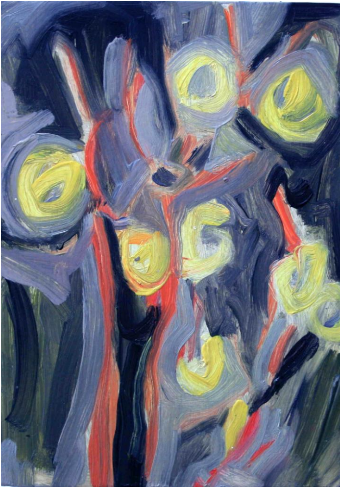
1. Moths Moon Flower 5 – oils on birch, 18cm x 13cm framed - £350