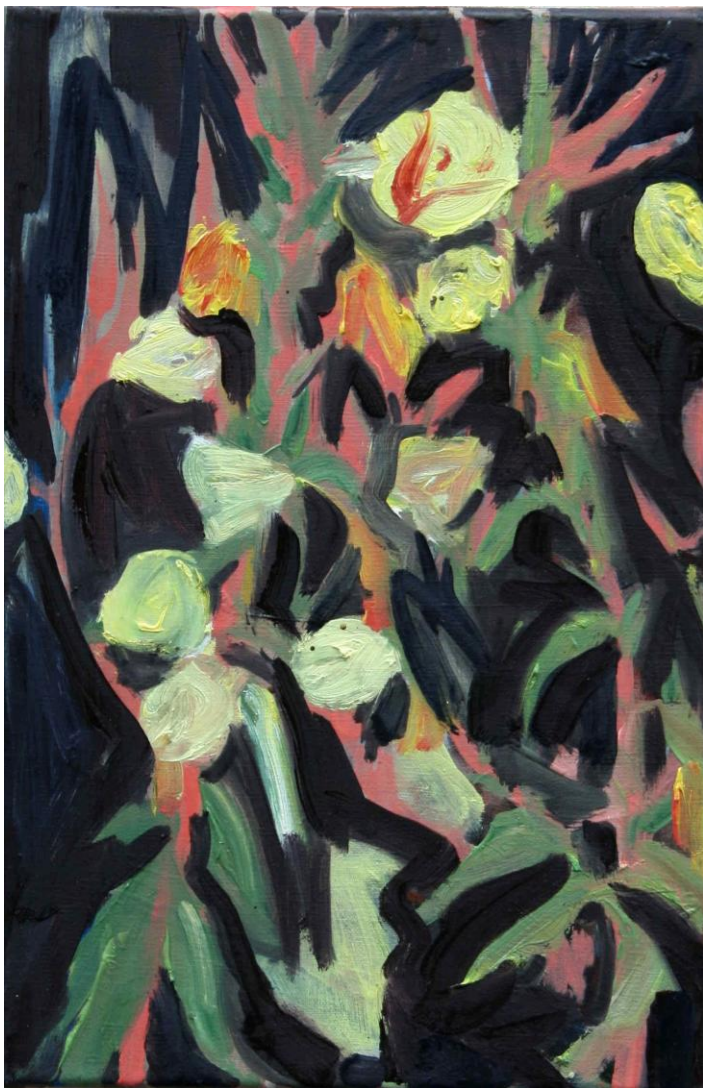
9. Night Willow Herb 3 – oils on linen, 41cm x 27cm framed - £650