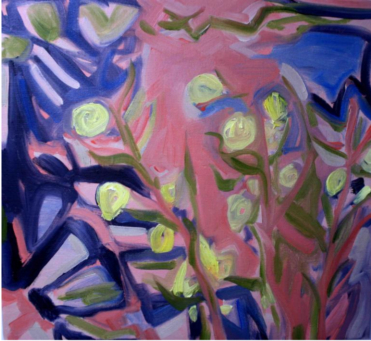
6. Moths Moon Flower 3 – oils on canvas, 56cm x 61cm framed - £1,950