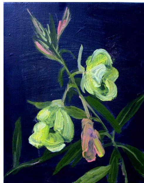
16. Moon Flower 3 – oils on linen, 30cm x 24cm framed - £550