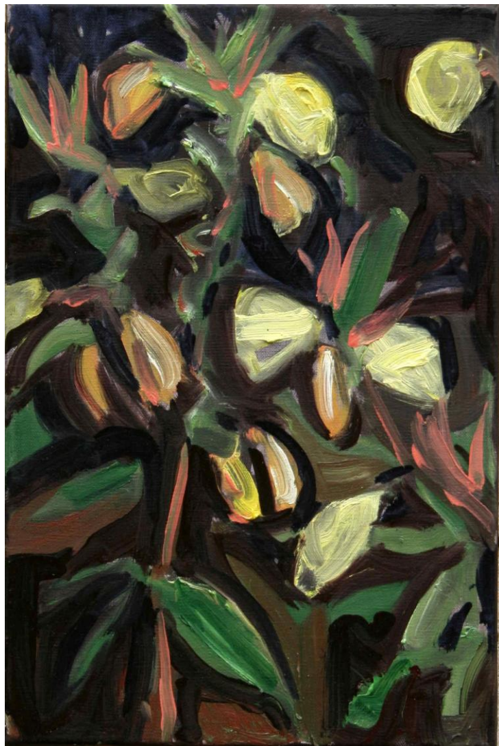
10. Night Willow Herb 1 – oils on linen, 41cm x 27cm framed - £650