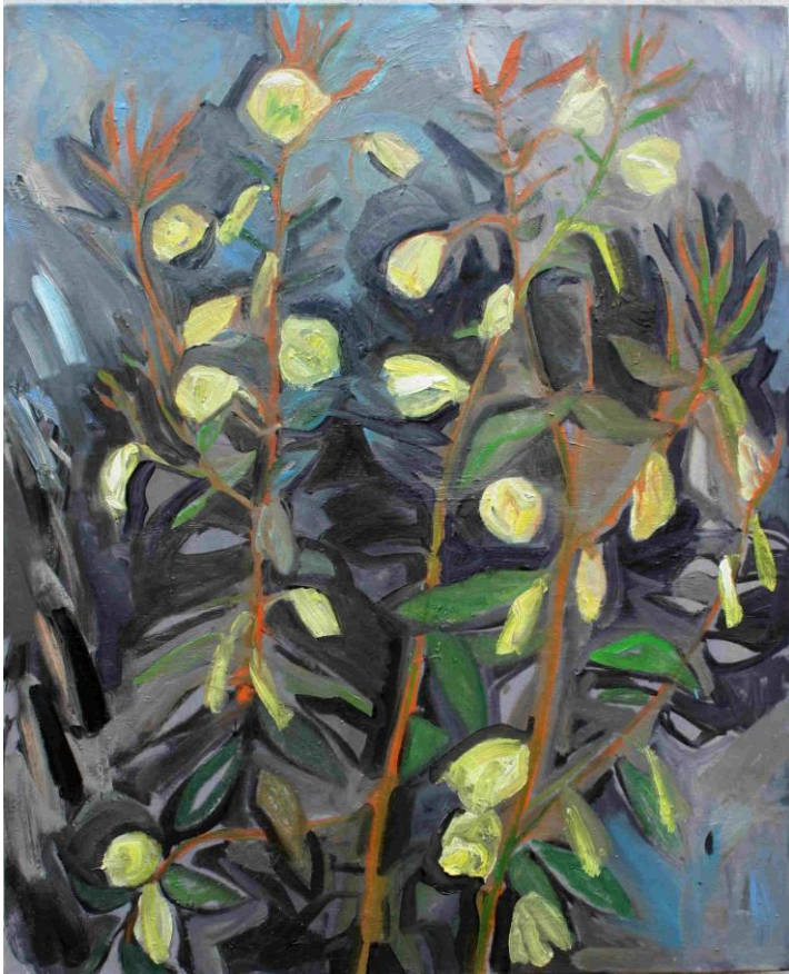
11. Moths Moon Flower 1 – oils on linen, 100cm x 82cm framed - £2,950