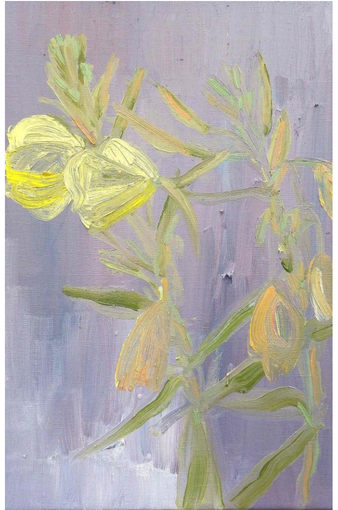
2. Night Willow Herb 2 – oils on linen, 42cm x 27cm framed - £650