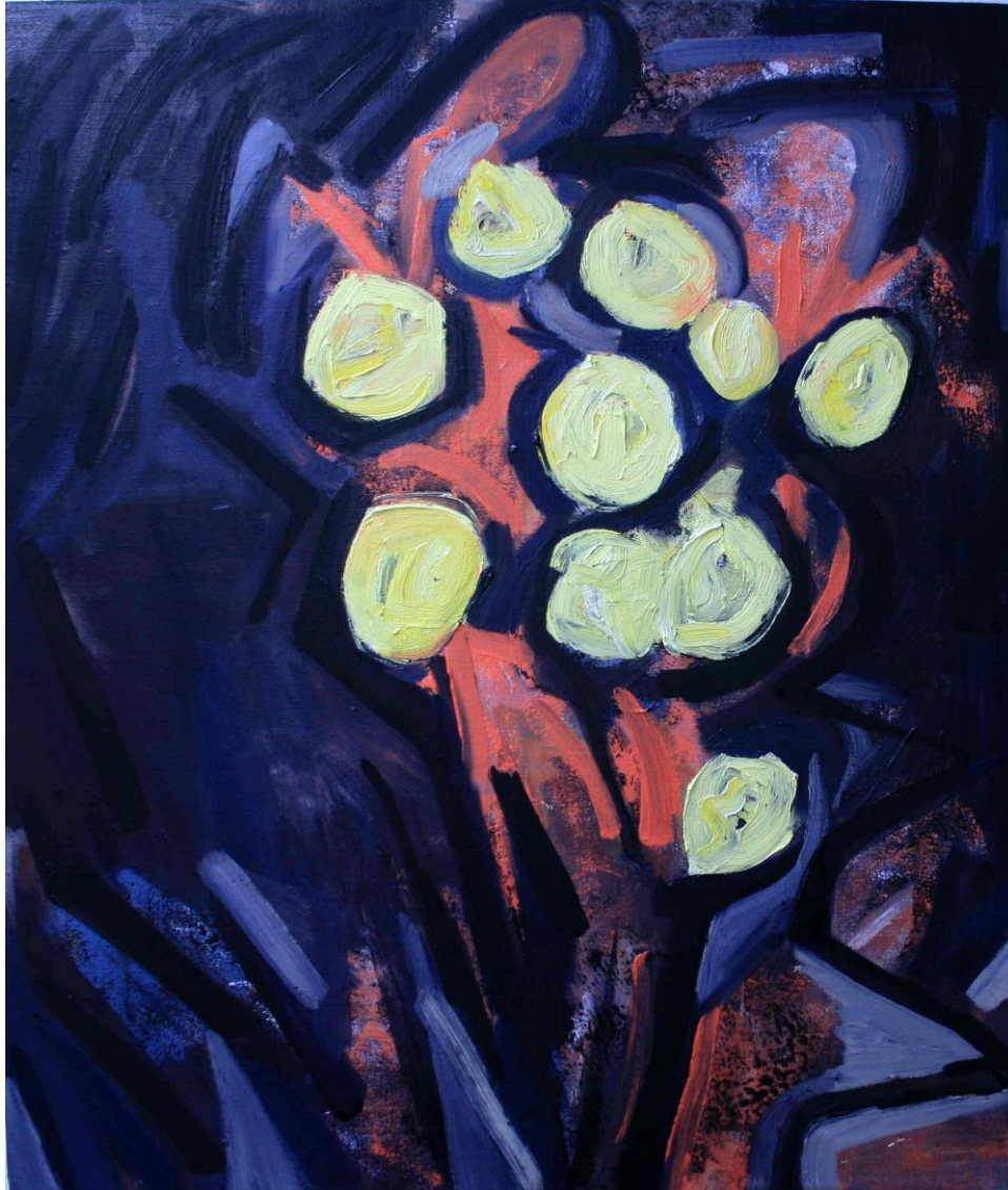
13. Moths Moon Flower 3 – oils on linen 70cm x 60cm framed - £2,150