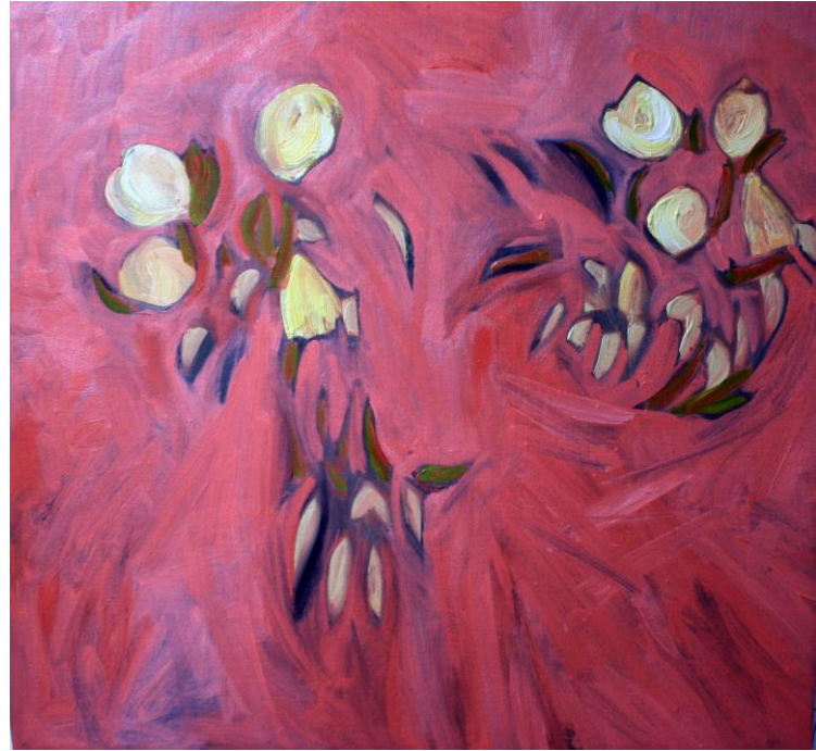
5. Vespertine Yellow 2 - oils on linen, 67cm x 72cm framed - £2,350