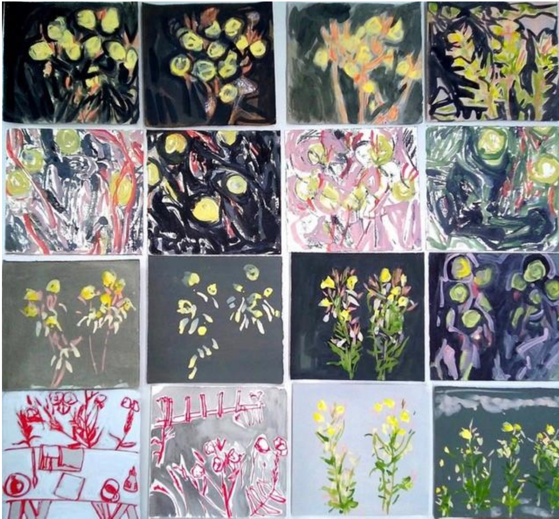
3. Evening Primrose Works on Paper 1 to 17 - 24cm x 26cm unframed - £495 each