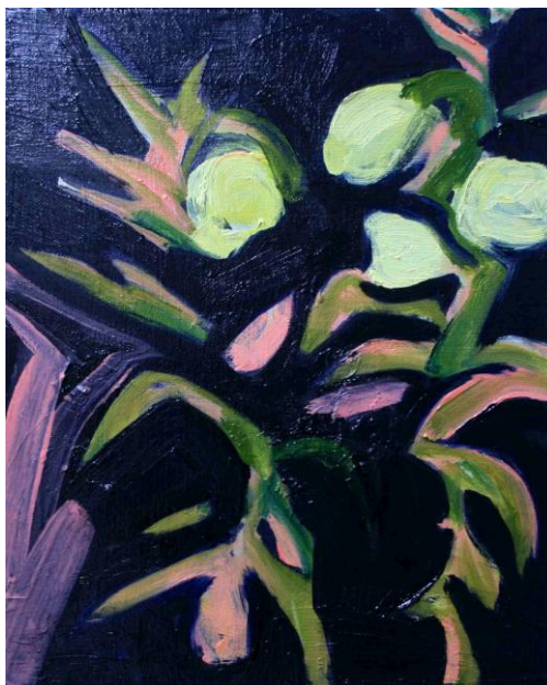
15. Moon Flower 2 – oils on linen, 30cm x 24cm framed - £550